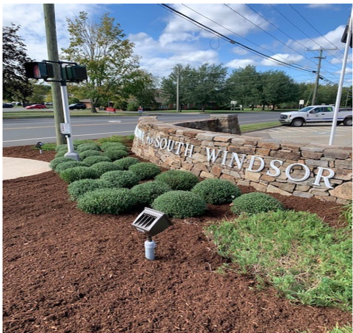
We landscaped the Town of South Windsor sign and flagpole with new mums for the fall.