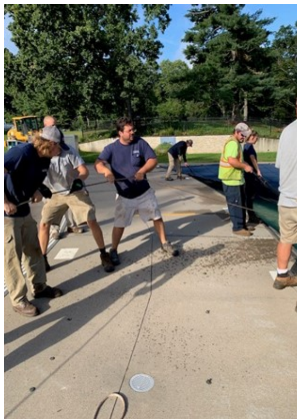
We closed VMP for the season! A big thanks for the Parks crew and Public Works for putting the covers back on for the winter. We are already excited for summer 2022!