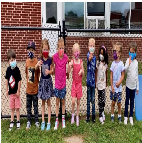
One of our preschool classes ready for their first day of school!