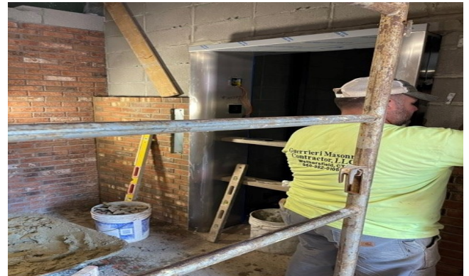
Town Hall Elevator Work in Progress

audit several buildings including the Town Hall, Police Department, the Edward F. Havens Sr., South Windsor Annex and Fire Company #2. Thus far each of those buildings has something that needs to be addressed to make them fully accessible. At the end of the building audits the Architect will provide documentation indicating what is currently out of compliance, provide recommendations specific to each building to rectify those items and lastly, provide a budget for the updates and a timetable for construction based upon the available funds to do the work. Audits are expected to continue through December.