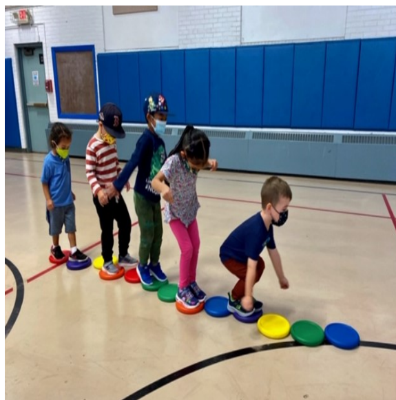
We love playing all sorts of games to get our bodies