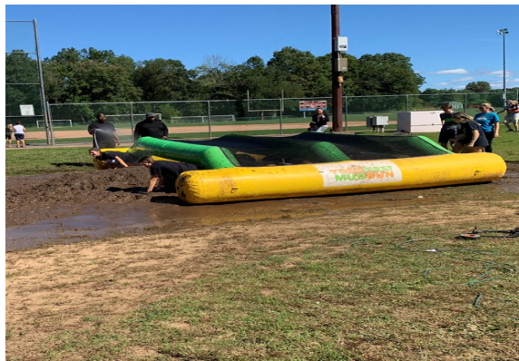
Fun, but challenging obstacles for our mud run participants! The mud run featured obstacles such as rope climbs, inner tubes, mud pits etc. Our participants loved the mud pit!