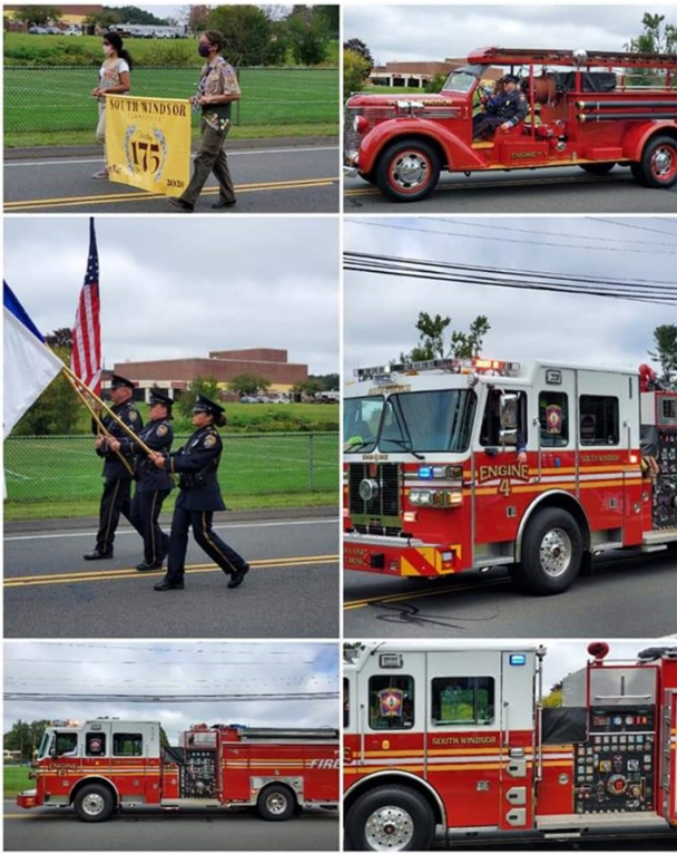
The 175th Anniversary celebration held on September 17-18 was a success. Thank you to all Town departments for helping support this event for the Town.