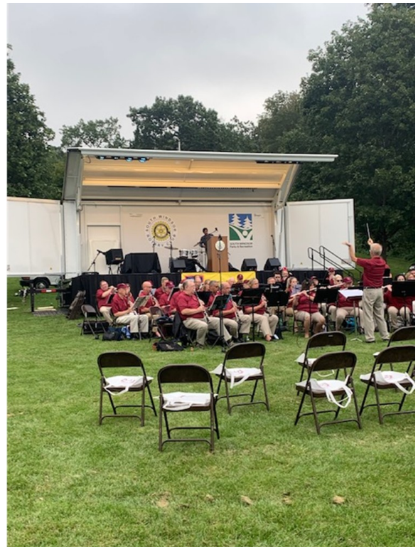
Our new showmobile was featured at the 175 th anniversary! The community band along with the Savage Brothers were the featured entertainment.