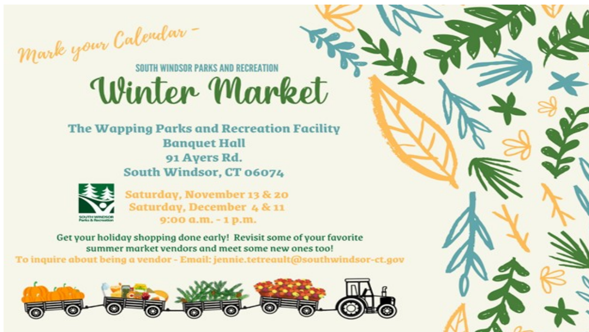
Our first ever winter market will be held at the banquet hall!