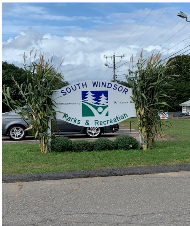
Decorating for the fall season around the town!