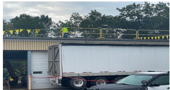
Public Works Garage Roof Replacement

The start date was pushed off until Monday the 27 th but mobilizing of equipment staging materials and setting up safety roof fencing all happened on Friday the 24 th . On Monday the 27 th , a crew of ten were onsite to start ripping a section the roof on the east bay including gutters and downspouts. About one-third of the bay roof can be ripped and replaced in one day. With exception to a couple of small areas that will need to be replaced the roof decking looks to be in good condition. Once finished with the east bay the contractor will move onto the west bay and then on to the main administrative section of the building.