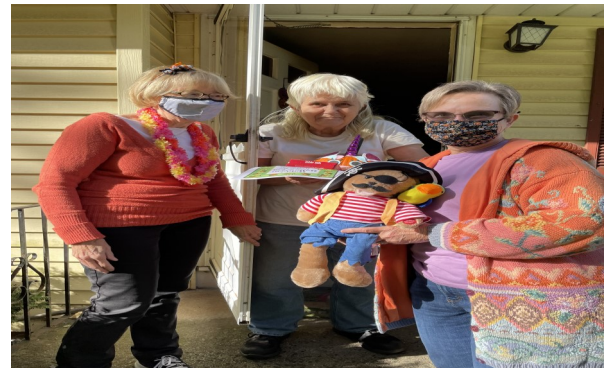
Pumpkins for Homebound