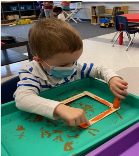
Our preschool teachers always have the best activities planned for our preschoolers to learn, explore, and play!