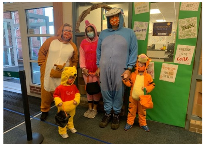
We love all of the costumes our families and youth wore at the Hullabaloo!

or-Treating Extravaganza: Halloween Hullabaloo! Throughout the event over 400 kids and their parents trick-or-treated through the Wapping Parks