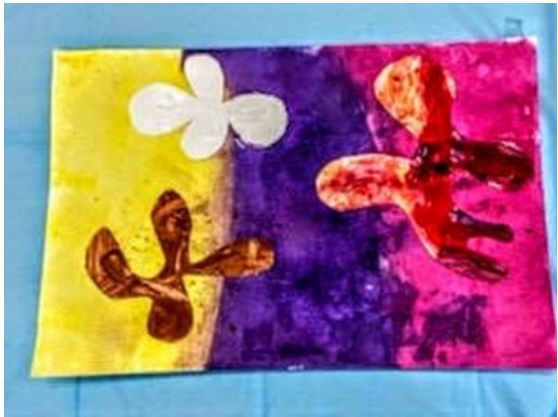
A few of our Abakadoodle art class participants 3D art work! We love the talent and creativity these youth display.