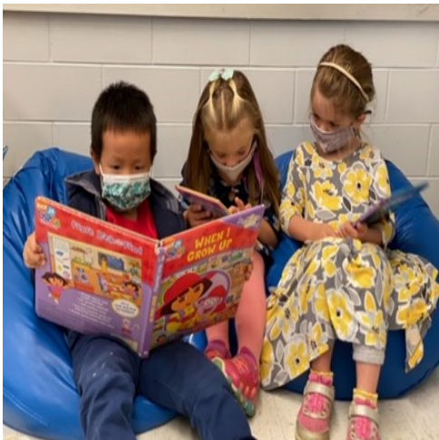
We made a lot of new friends this session!