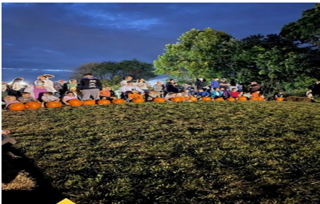
We had tons of fun with this event! Youth and adults alike enjoyed racing pumpkins down the hill.

Wellness Programs: Our Jukido program has been growing since we've added an additional night to the schedule. In October we had a total of 20 participants which means the program has nearly doubled in the past couple of months! We look forward to seeing this program grow with the potential of adding additional days. Over the course of the month we had over 35 participants participate in our virtual yoga classes which took place on Tuesday mornings, Tuesday evenings and Wednesday evenings. Since classes were being held virtually, we were able to have participants from all over the United States participate! We look forward to bringing this program back in person in November. This program will grow into a hybrid program where participants can choose to come in person or take classes from home. The new hybrid options give participants the flexibility to switch between in person and virtually throughout the month.