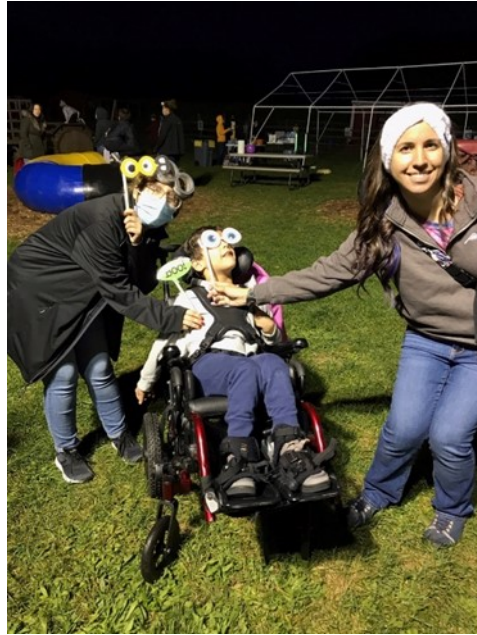
Our 4 th "R" program had an awesome time at the annual foster farms fall family night!