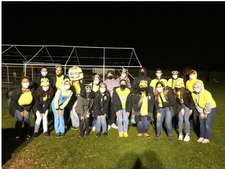
Our 4 th "R" staff getting into character for the minion's theme! They are truly the best!