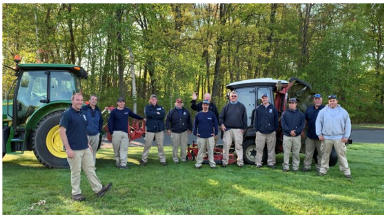
Say hello to your South Windsor Parks crew!