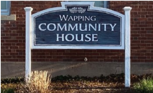
New Sign Rendering