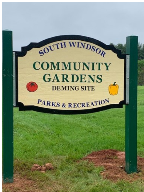
New Deming Gardens sign that was made by the Parks crew.