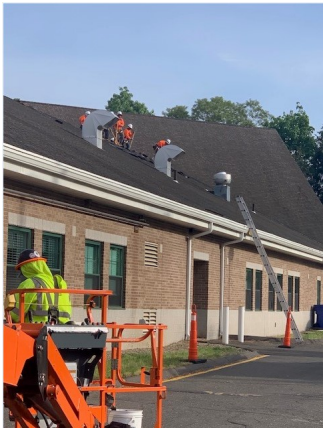
Community Center Roof Replacement