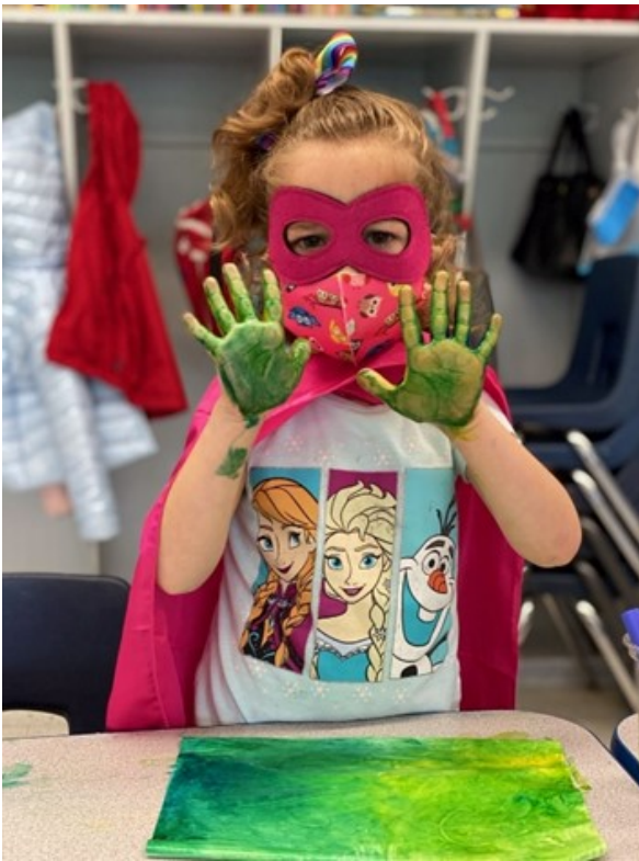
Superhero art fun at our preschool!