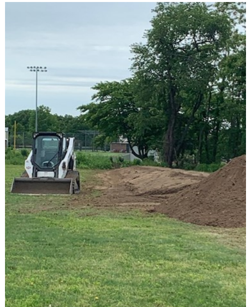
The Parks crew constructing the new road and berm at 220 Nevers road for the new Farmers market location.