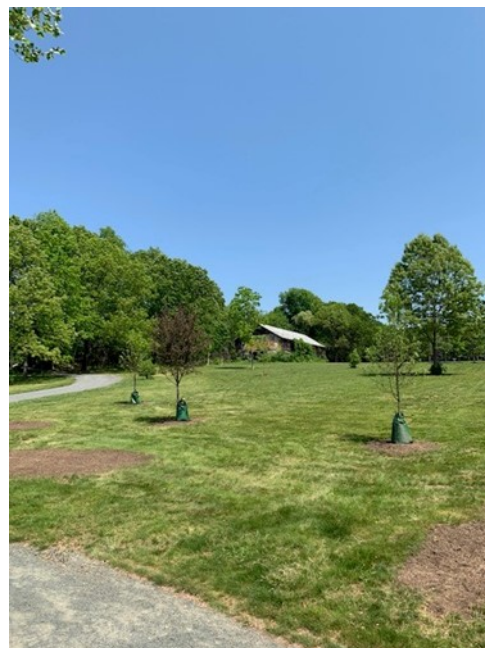
White and pink flowering Crab Apple Trees at Nevers Park to the west of Bark Park