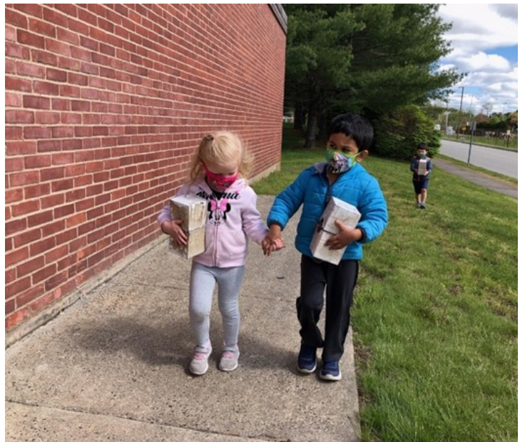
Our preschool friends exploring the outside with a nature scavenger hunt.