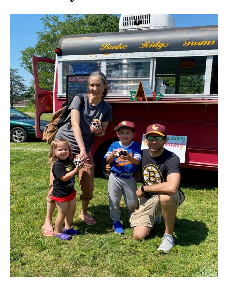
Families are enjoying the yummy treats at our farmers' market!

We had over 120 tomato plants donated from Prides' corner. Our community garden participants, summer camp kids, and senior center members all loved receiving these plants.