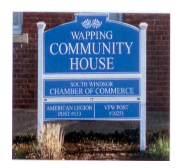
New Sign Rendering