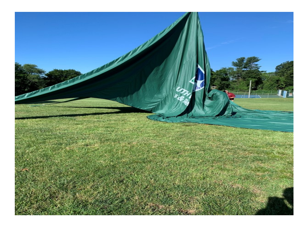
Our parks crew set-up the tents outside of Wapping for our summer camp!