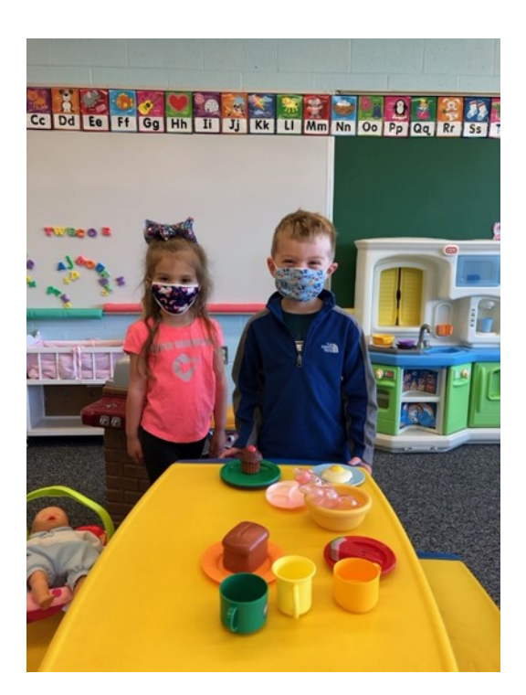
Pretend play with some friends