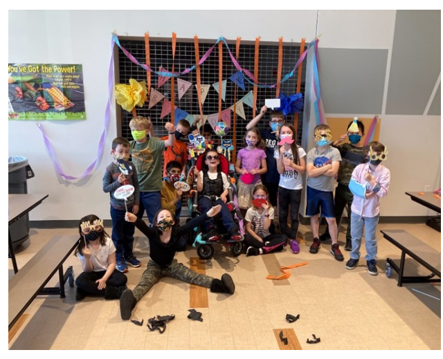
Celebrating all of our 4th "R" friends'