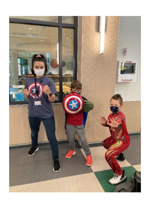
Superhero Theme day!