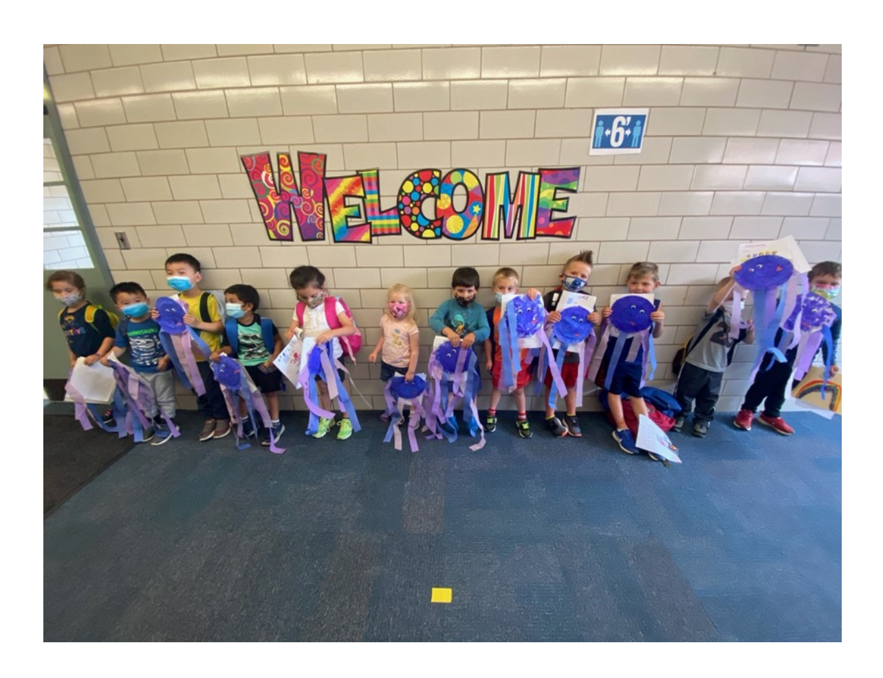
Ocean themed arts and crafts