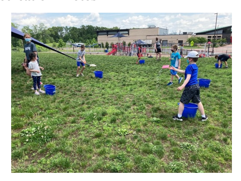
Enjoying the warm weather with some water games!