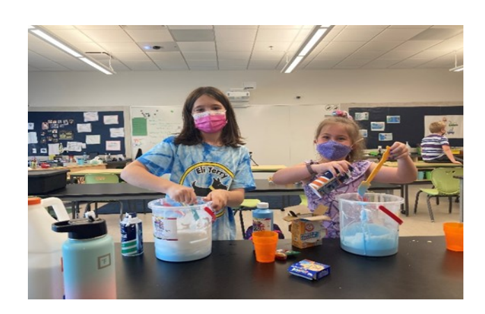
4<sup>th</sup> "R' friends having fun making some puffy paint slime!