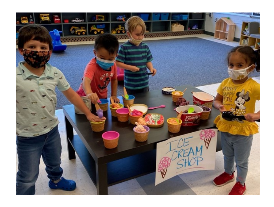
Sensory play ice cream shop