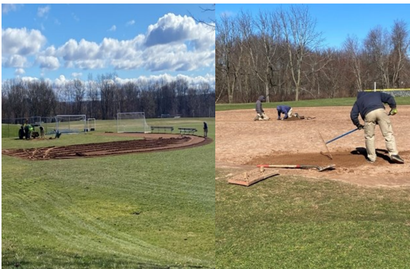
Renovations were made to the Little League Complex along with the TE and Orchard Hill Fields to prep for early practices.