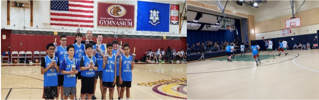
Boys' basketball playoffs ran from March 15-March 24.