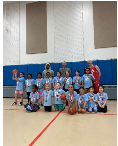
More Mighty Mites end of season Team photos