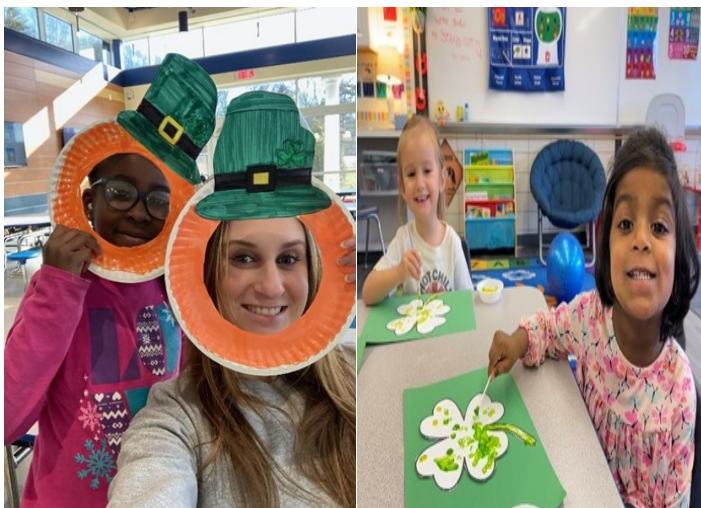
St. Patrick's Day leprechaun hats and four leaf clover projects!