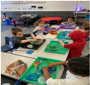
We had a lot of creative fun this session in our pre-school!