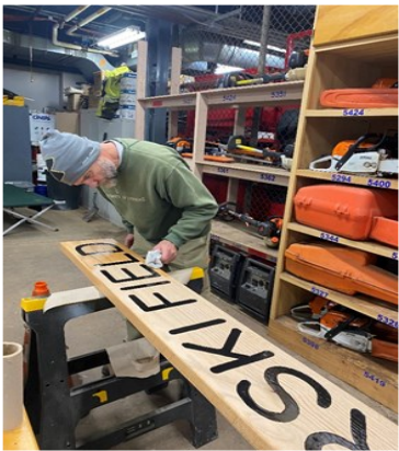
New Zagorski Field sign for Rye Street