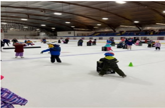
Our Learn to Skate participants in action!