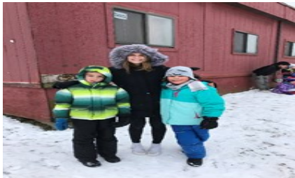
We had “snow” much fun outside during our 4th R snow day program!