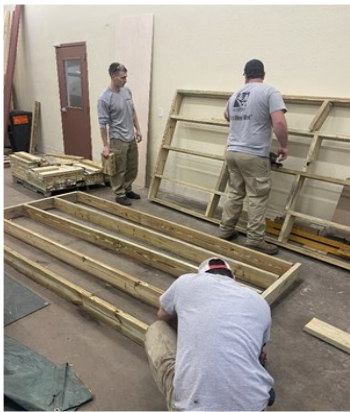
Crew works on new bridges for the Donnelly Trails