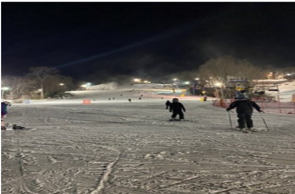
Ski and Snowboard Club at MT Southington