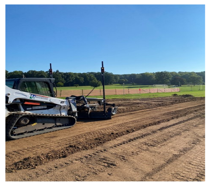
Nevers Park Soccer Field Regrading Project

• We have begun regrading a field at Nevers Soccer. Specifically, this field runs parallel to Sand Hill Road and was once used as the original town dump. Because of this, there is settling issues that posed a safety hazard to players on the field. The field will be regraded and seeded by the end of September and be ready for Spring play.