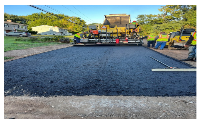
Paving Pleasant Valley Rd heading west from the bridge

O&G Industries continues work to reconstruct Pleasant Valley Road Phase 1 from Ellington Road to Pepin Place and replace the bridge over the Podunk River. This project includes improving the road geometry, new drainage pipes and structures, and sidewalks on one side of the road, as well as replacement of the existing Pleasant Valley Road Bridge over the Podunk River. O&G has poured one concrete bridge abutment and is working on forming and pouring the second concrete bridge abutment and the approach walls. The concrete bridge beams are scheduled to be installed in October. They have installed new storm drainage pipes and structures, stone base, and installed the binder course of pavement on the west section of road from Pepin Place to the bridge. They are installing new storm drainage pipes and structures east of the bridge to Ellington Road. Once the storm drainage is installed, O&G will install new road base and grade the east section road for paving. Additional utility poles need to be relocated to complete the new road and drainage work. The road will remain closed to through traffic until the bridge has been rebuilt. Residents are able to get to their properties along and off of this section of Pleasant Valley Road. There will be delays and residents are advised to plan for extra time when traveling in this area.