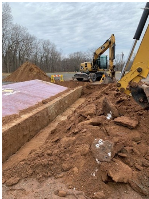
Site work was completed at the Rye St Pickleball court.