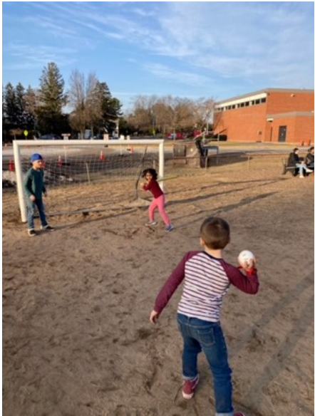
We love to play and have fun at 4 th "R"