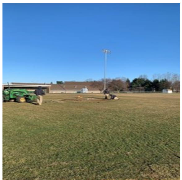
Spring renovation of baseball fields in preparation for the season.