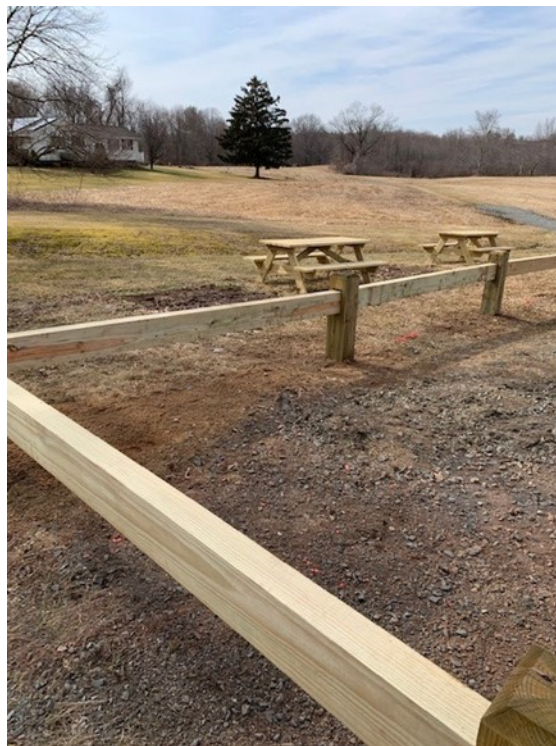
Installation of guardrail fencing and the deployment of newly constructed picnic tables at Wapping Park.