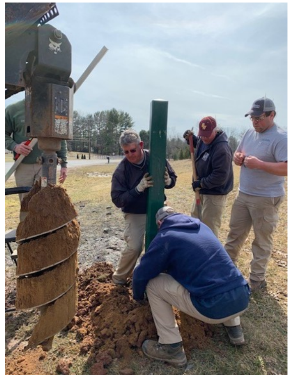
Newly fabricated John J. Mitchell sign installed on March 15th