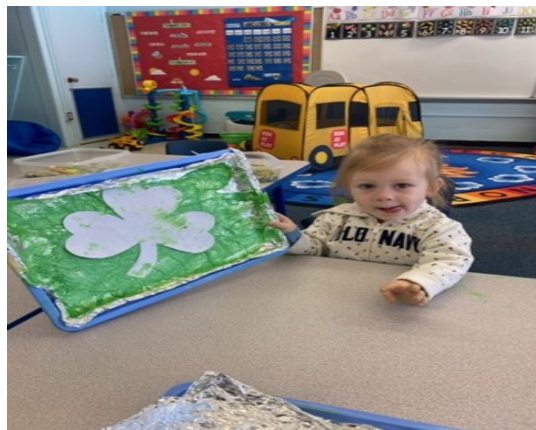
Making some fun crafts for St. Patrick's Day!