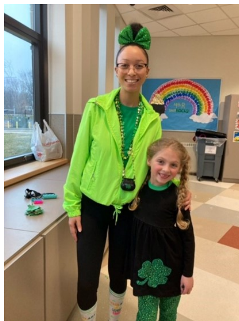
Celebrating St. Patrick's Day with our awesome 4 th "R" staff!