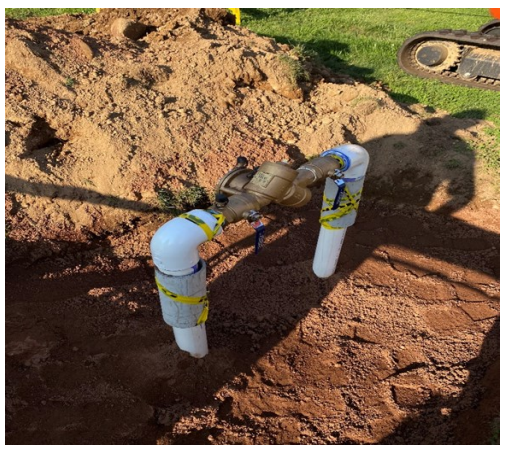
Parks Crew added a new backflow preventer at the Nevers Park soccer field.