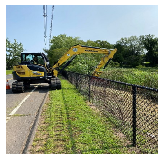
Rob is completing yearly maintenance of the Firehouse and Duck Pond.