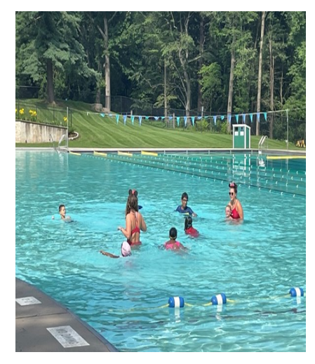
Over 800 youth and adults participated in swim lessons at VMP this summer.