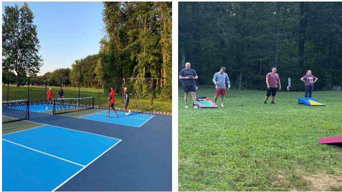
Whether its Pickleball or Cornhole, we had plenty of ways for our adults to recreate this summer!