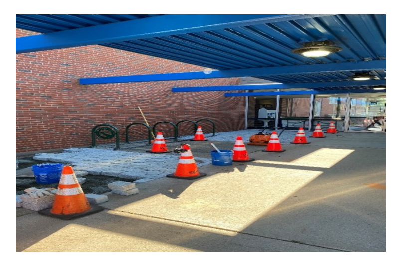
We added Belgian blocks at the entrance to Recreations new home at _{\rm 350} Foster Street.