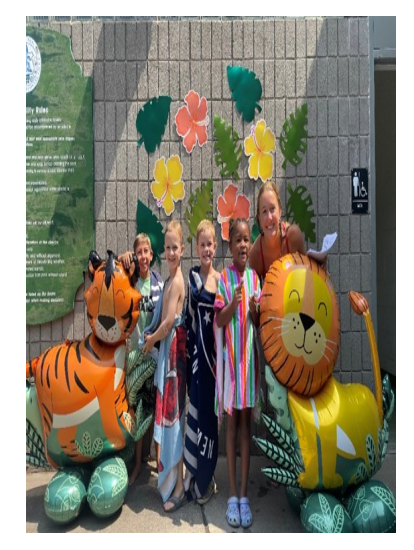
Swim lesson theme days are so fun with our awesome instructors!