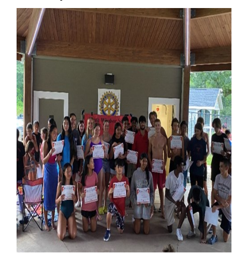
Our 125 participants among the three divisions celebrating their successful season at our end of summer banquet!