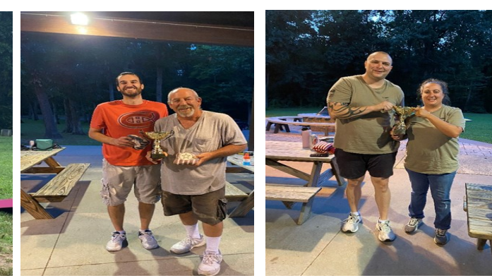
Our Cornhole League winners proudly displaying their trophies.