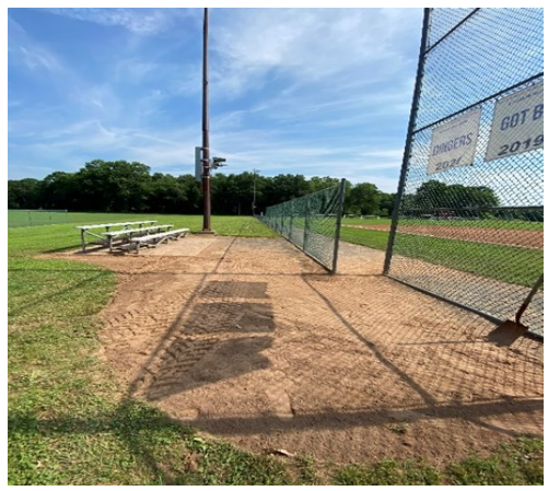
New stone dust to our spectator and player areas at our Rye Street fields.

Continued tree work and maintenance of open space this summer.