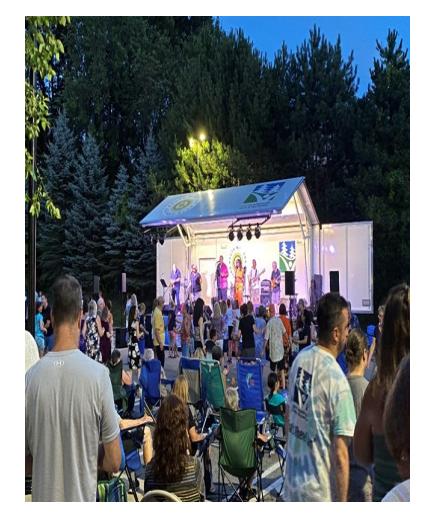
Summer Concert Series at Evergreen Walk.