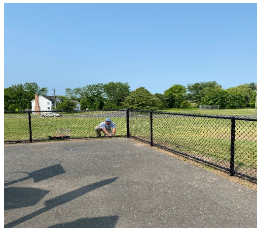
We installed new fencing at Kevin's Court this month to replace an older vandalized fence.