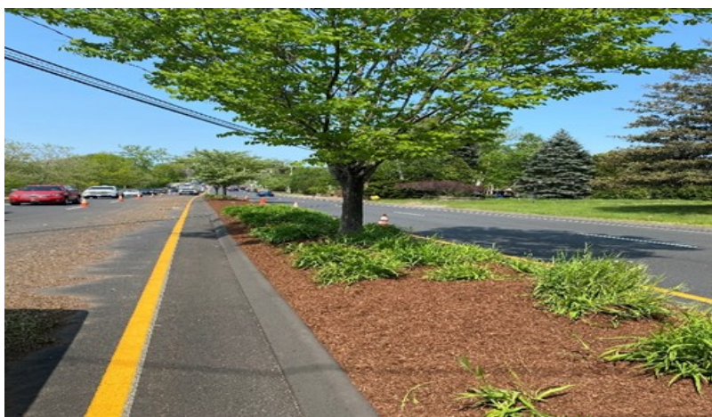
Buckland Islands were cleaned up for the summer with fresh mulch and plantings.