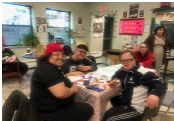
Monday Night Social Club enjoying time together making cards and decorating cookies!