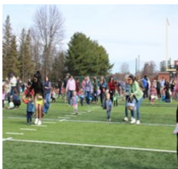
What an Egg-Cellent time at our 50 th annual Egg Hunt!