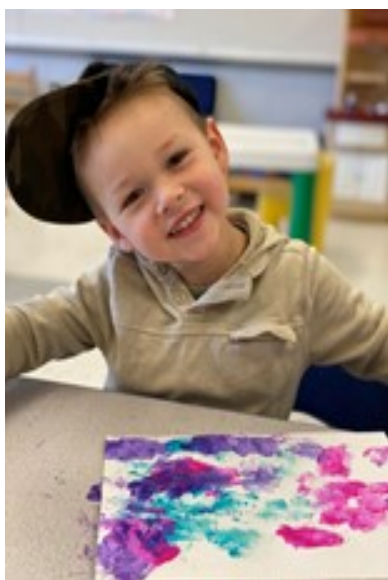
Pre-school has many ways of learning through play- from box cars to art!