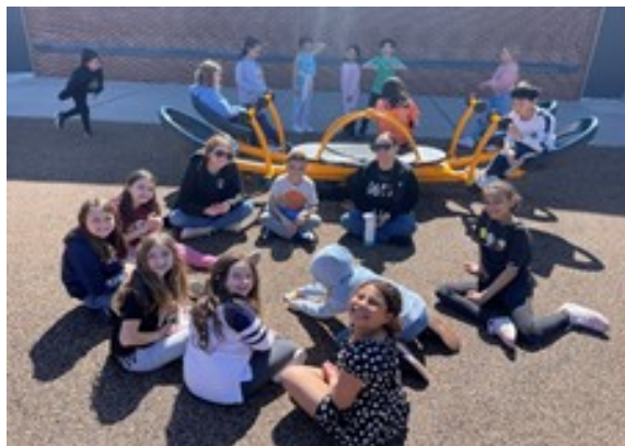
4 th "R" enjoying time outdoors with friends!