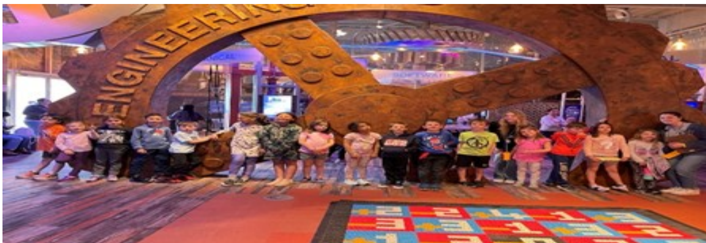
Vacation Day program was a full week of fun!