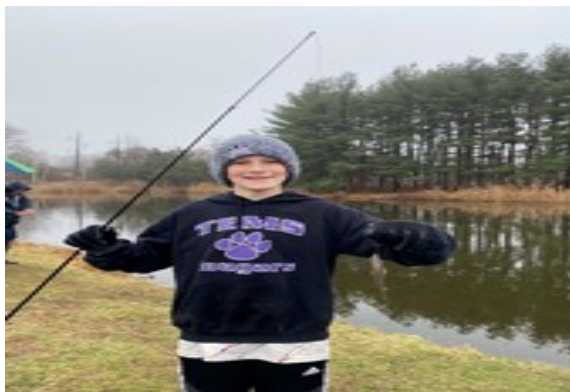
Well it's oh-fish-al, our 38 th Fishing Derby was a success!