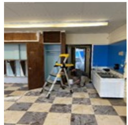
Crew continues improvements at Old Orchard Hill by priming and painting walls, ceilings and cubbies.