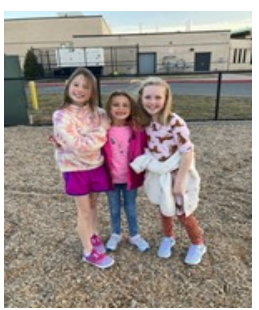
4 th R friends enjoyed a variety of activities this month!