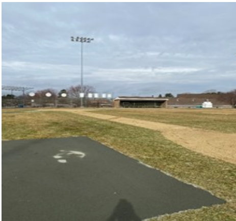
Renovation at the Rotary Baseball Field.