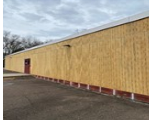
Parks Crew removed old rotten T-111 walls from the Old Orchard Hill School portables and replaced it