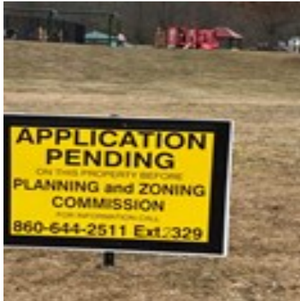
Splash Pad get its final approval for Nevers Park! Donated benches get refurbished for Park & Buildings.