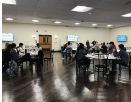
Our mid-year 4 th "R" staff training was held in February! Topics included Behavior Management, communication and Energy/Engagement to beat the winter blues.