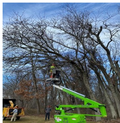
The Parks Crew continues tree work to remove damaged and decaying trees at Rye Street.