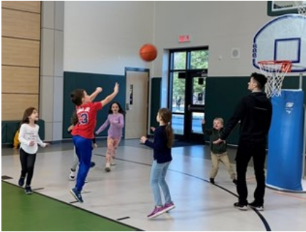
Staying active at 4 th "R" with a variety of gym games after school!