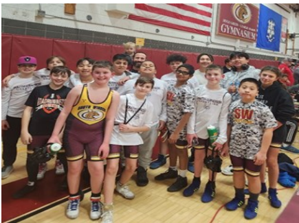
A lot of smiling faces from our youth wrestling athletes after they hosted a home meet in February!