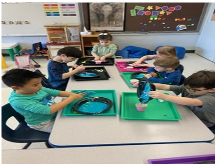
Our Preschoolers enjoying playing with fun and messy creations!