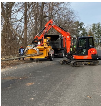
Main Street tree work for BOE.