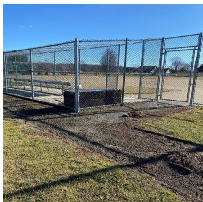
Due to the mild winter, we did some preseason work on ballfields at Orchard Hill Baseball field and ADA path work at Ayers Softball field