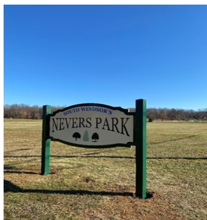
New Nevers Parks Sign designed, built and installed. Main Street tree work for BOE.