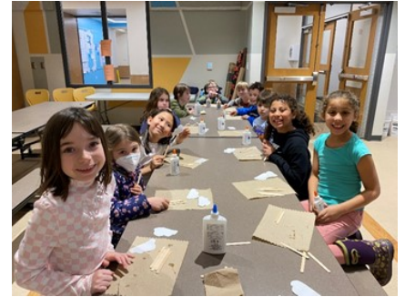
All smiles while making fun projects at 4 th "R".