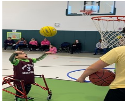
Challenger basketball finished another fun season on February 11.