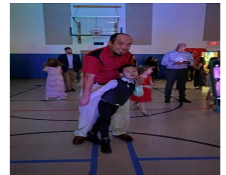
Our families enjoyed dancing the night away at our family sweetheart dance held at Wapping Parks and Recreation facility on February 10.