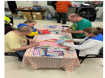
Our MNSC participants making Valentine's Day cards!