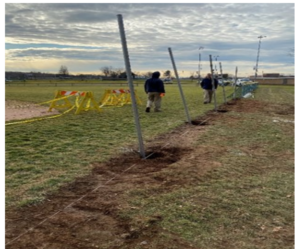
Long overdue upgrades to Little League complex fencing on the right field line of Major B.