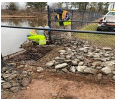
Desmonds Duck Pond fence and outlet repairs