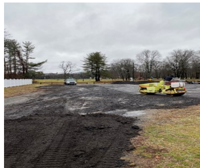
Improvements to the Rye Street Park basketball court lot by resurfacing the space with 100 yards of millings.