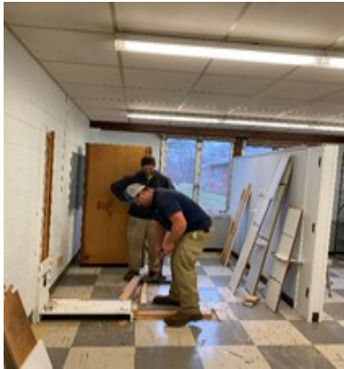
Work began this winter at Old Orchard Hill to prepare for the Recreation team to move to the facility in the spring.