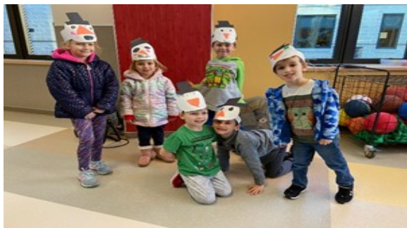
4 th R participants had lots of fun with snowmen activities this month.