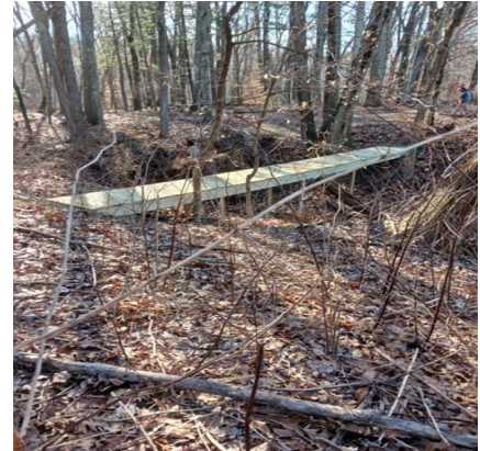
New 40' bridge for a new trail at Rye St. Park