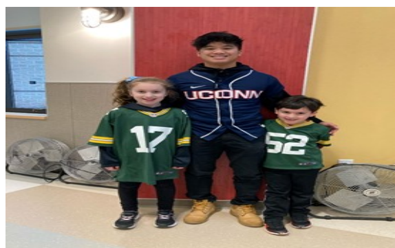
4 th R hosted a variety of theme days including crazy hat day and jersey day!