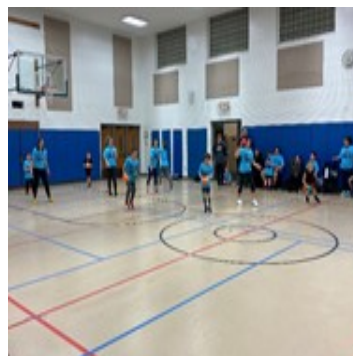
Dodgeball throw down was a fun time for all!