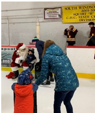
We had such a great turn out for Skate with Santa! Thank you everyone who attended and donated a toy.