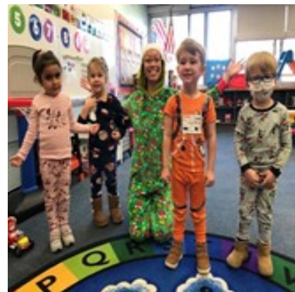
Our Preschooler's participating in the PJ Day for Kids program to raise awareness and donations for the CT Children's Hospital.