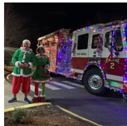
Monday Night Social Club had their annual holiday party with a surprise visit from a festive fire truck with Santa's helpers.