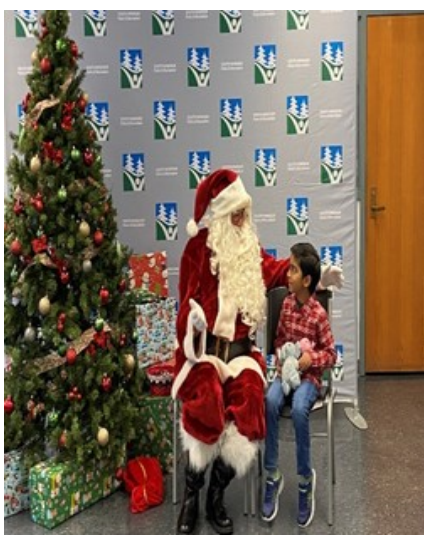
Santa got to hang with some of his friends on December 10 at the Parks and Rec facility.