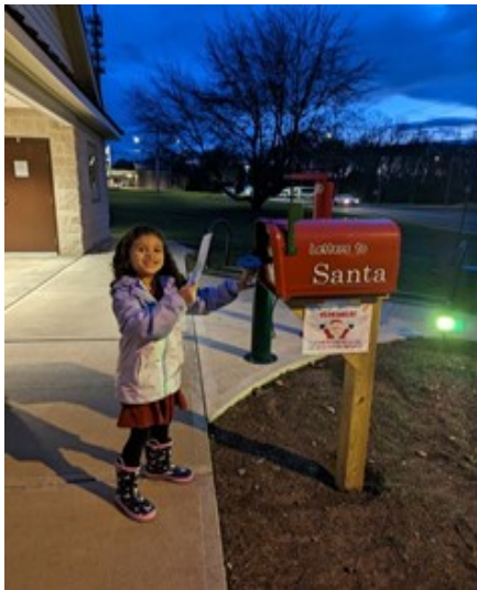
Santa's big red mailbox was up all December for our South Windsor youth to send Santa a letter.