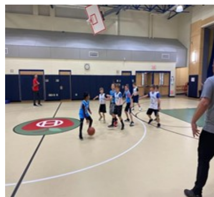
First weekend of games for our youth basketball program!