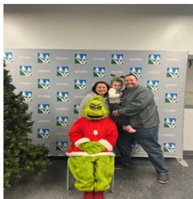
A big Thank you to Dzen Tree farm for sponsoring this year's Grinchmas!