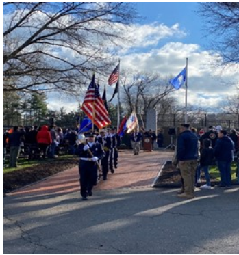
The Wreaths Across America event was held at VMP on Saturday, December 17.