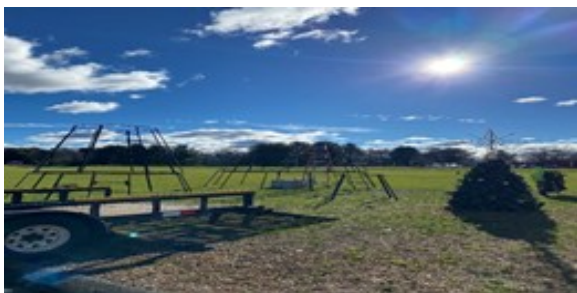
The South Windsor Parks Crew put up our 35-foot-tall Christmas tree in Nevers Park for the community to enjoy.