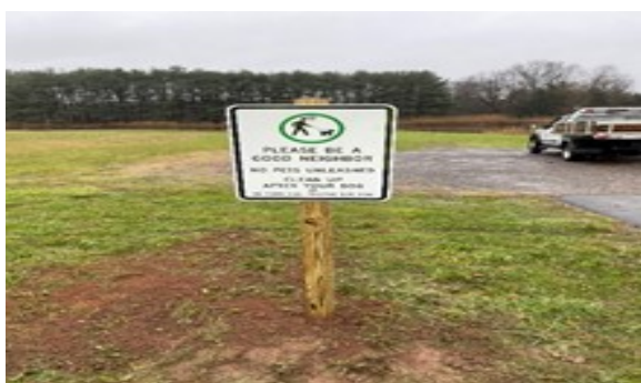
Two new Signs have been installed at the Fishing Derby pond off Frazier Fir Road.