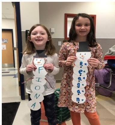
There was plenty of holiday fun at 4th "R" this month!