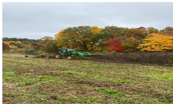
We mowed our open space field after frost so the pollinators are not disturbed.