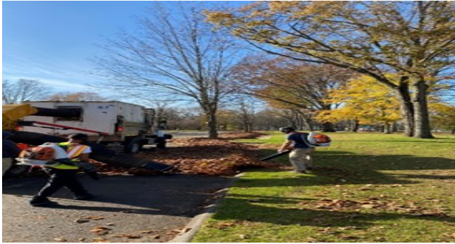
Park Department working hard on the leaf program