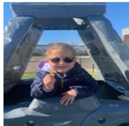
Our friends had so much fun playing and making crafts!