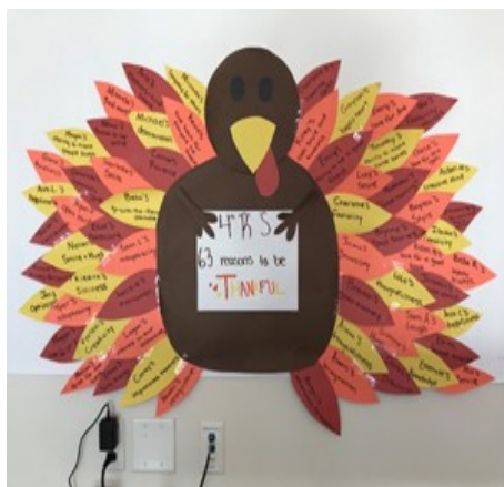
4 th R participants creating seasonal crafts