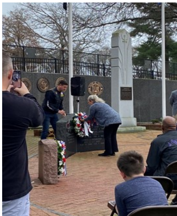
Our Veteran's day event hosted at VMP to honor all those who served.