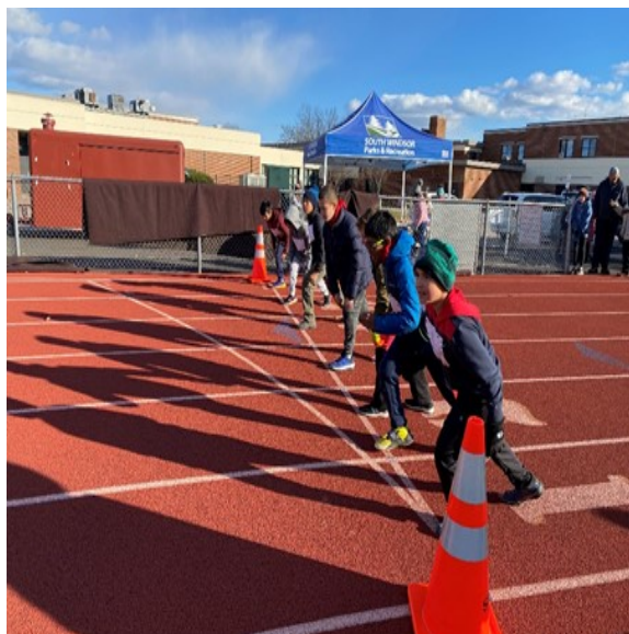
Our runners competing for fun Thanksgiving prizes at our annual Turkey Trot.