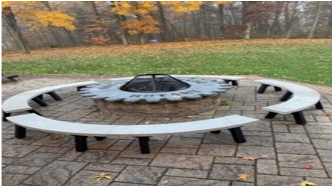
Installed new benches at the Rotary pavilion just in time for the November Moon light walk. We had over 70 community members attend the event.