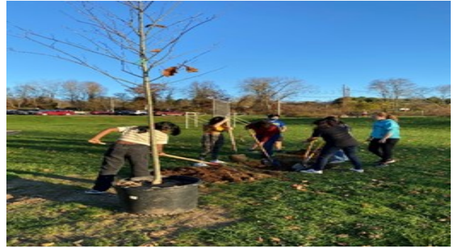
Environmental Club Planting new trees at Nevers Park. Thank you to the World Malayalee Council for their donation.