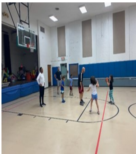
Family open gym scrimmages! We love seeing community members of all ages recreating together!