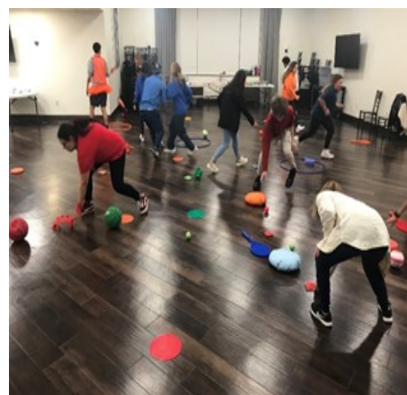
Our hardworking 4 th R staff enjoying the color war team building night!