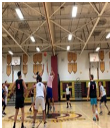
Our first Men's league game of the season on November 13!