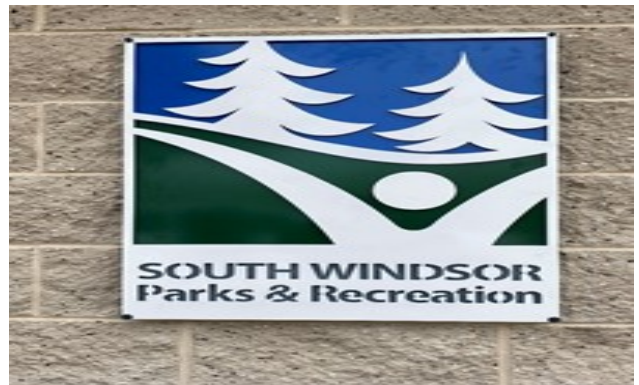
Parks installed new metal logo signs that were laser cut and layered so that they are dimensional. The signs are located at the Rotary bathrooms at Nevers Park.