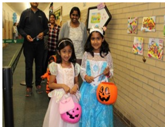
We loved seeing all of the costumes and Halloween spirit!