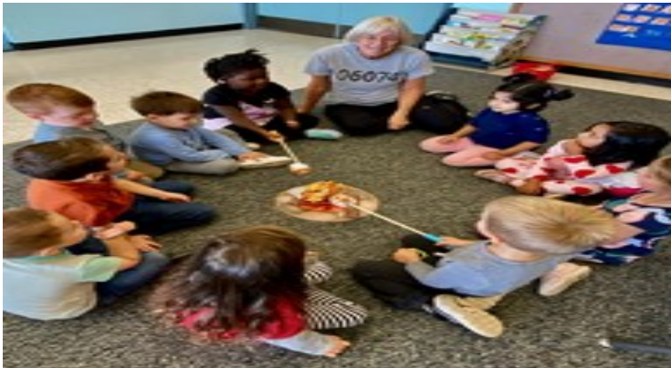
Our friends enjoyed a campfire story time with their preschool teacher!