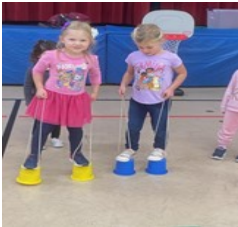
Our friends having fun while learning!