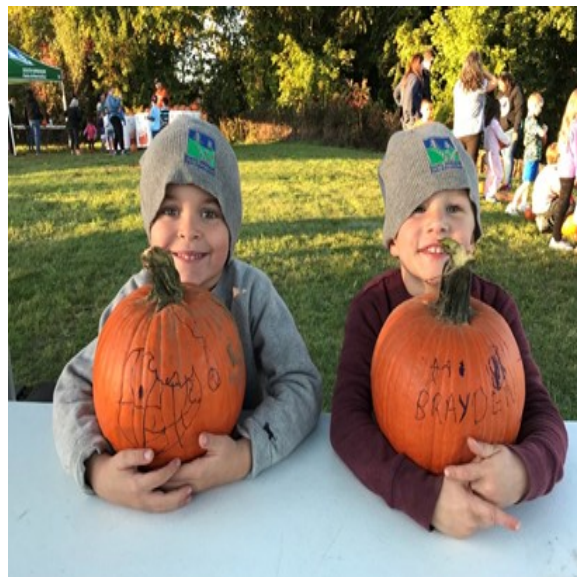
Community members of all ages had fun rolling pumpkins down Porter Hill at our annual pumpkin Roll event.