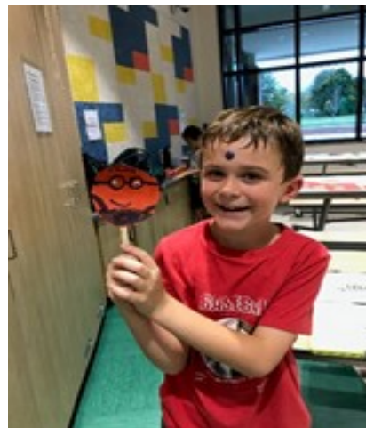
Our 4 th R friends participating in a variety of fall activities