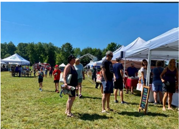
Thank you to our community members for supporting our local vendors each week at the Farmers Market.