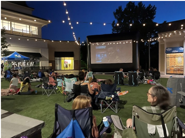
Free Friday Flicks provided the opportunity for families to gather under the stars to watch movies.