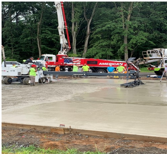
Site work and post tension concrete poured at Rye street Parks eight new Pickleball courts.