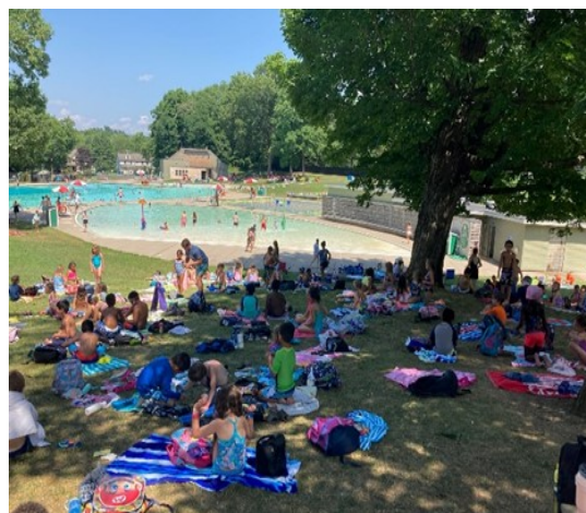
Our campers loved their weekly swim trip to VMP!