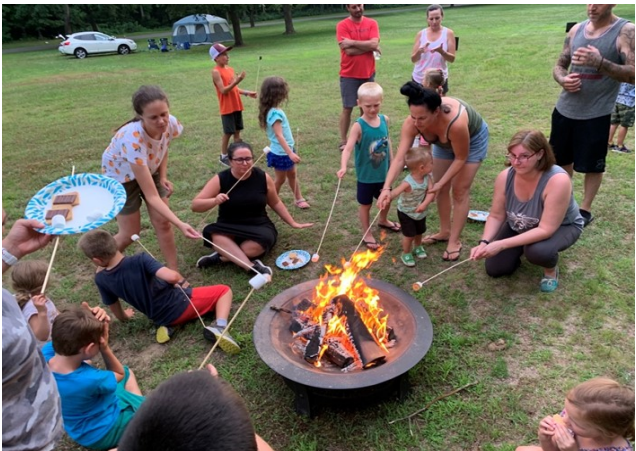
Family Camp out participants enjoying S'mores. Yum!