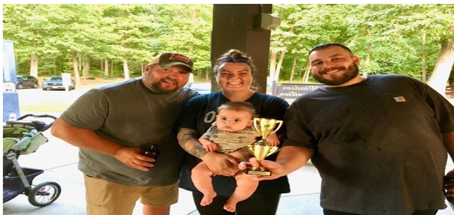
Congratulations to the Beanie Weenies! They won our 2022 Inaugural Cornhole League Championships.

Our first cornhole season was a hit! We look forward to expanding the league next year.