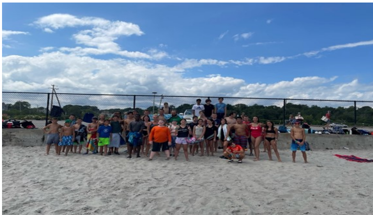
Adventure unit having a blast during their surfing field trip!