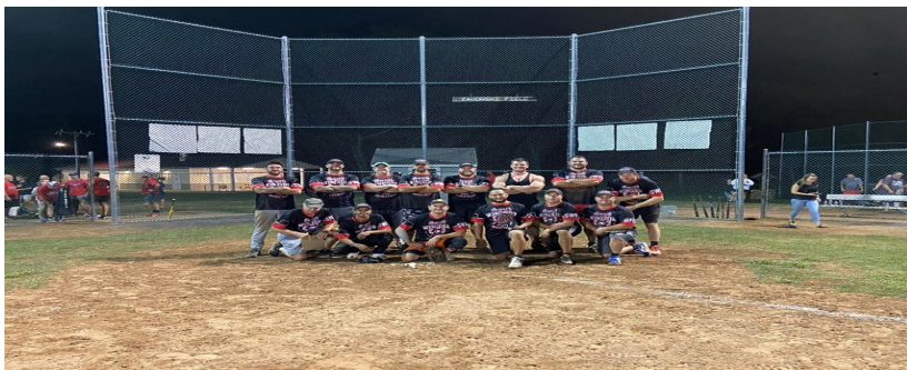
Congratulations to our 2022 Adult Softball League Champions, the South Windsor Fire Department!