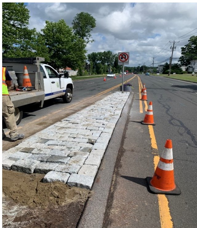
Jumbo cobble stones installed on the Buckland Islands