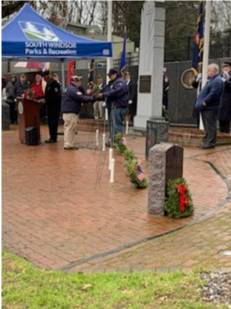
The Wreaths across America event was held on Saturday, December 18 at the VMP Eagle Patio.