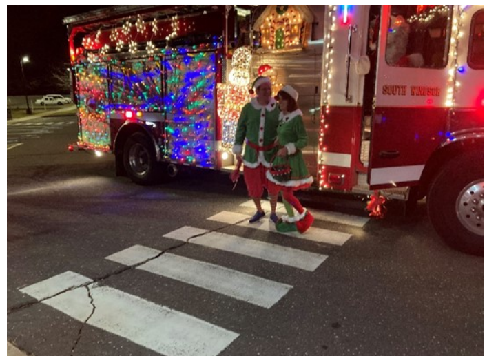
Our Monday Night Social Club had a special festive visitor come to their holiday party on December 20!