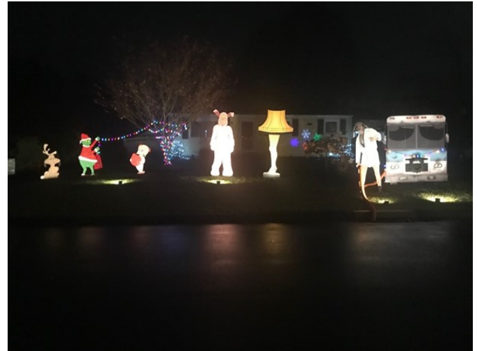
The Clark Griswold House award winner.