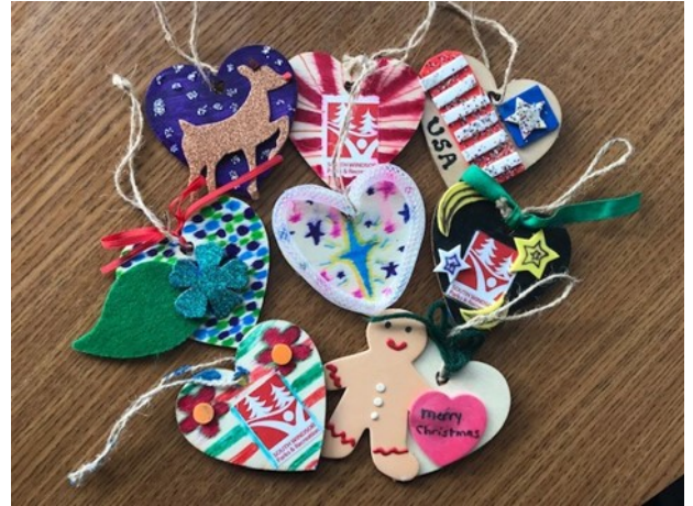
Some of our awesome decorated ornaments that were hung on the trees for Dec the rec!