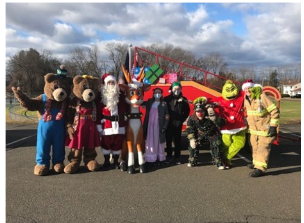
A big thank you to all of our festive characters who volunteered their time for this event!