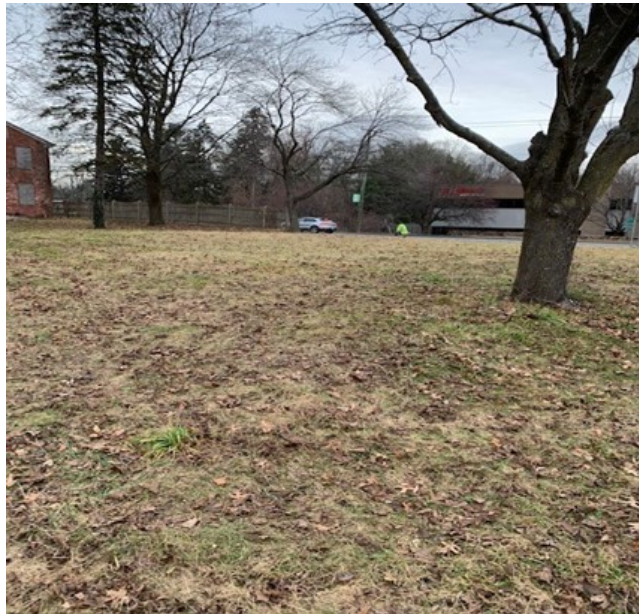
Parks also maintains the grounds at the old Clapp house on the corner of Sullivan Ave.