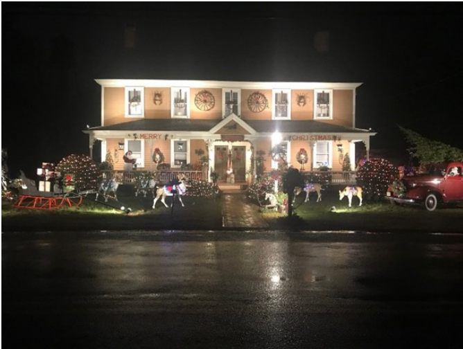
Buddy the Elf house award winner.