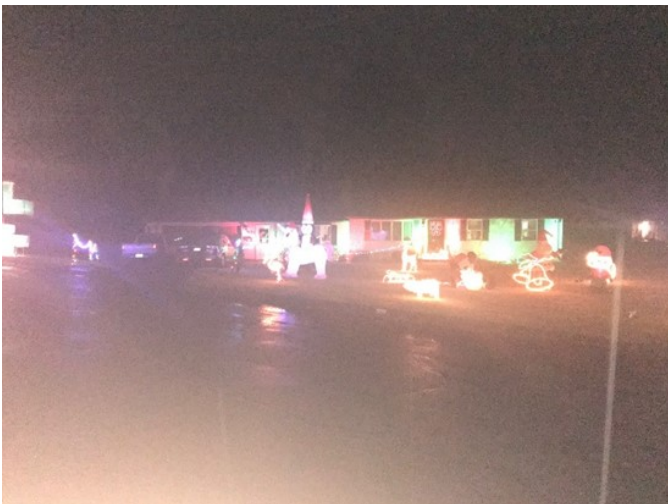
Rudolph's Shiny Nose House award winner. Wow, is that bright!

Our letters to Santa program continues to be a special way for our community to spread holiday cheer.