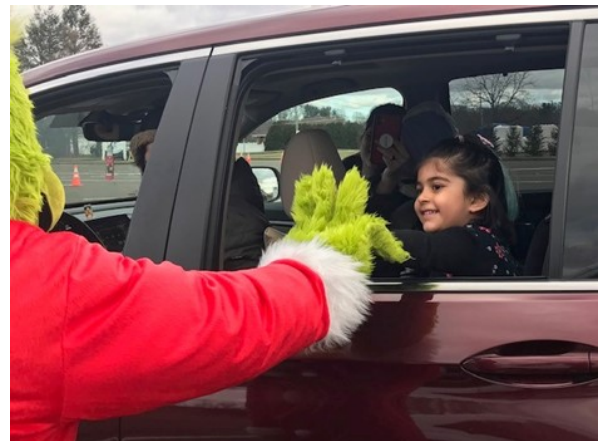
Community members driving by to say hello to Santa and special holiday characters!