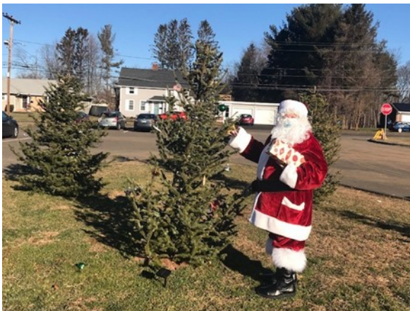
Santa came to hang an ornament on one of our Christmas trees outside of the Parks and Recreation building!