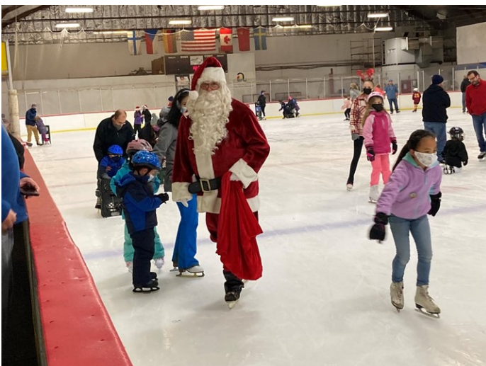
Our annual Skate with Santa event was so much fun! Participants skated around with Santa and our department mascots!