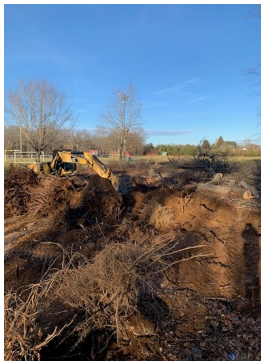
The Parks department getting the site ready for the Rye street Pickleball / Dek hockey project by doing stump removal and site work.