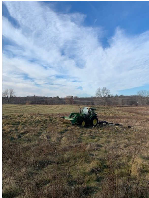
We mow many of our large open space areas only once a year in early winter, this allows the bees to continue to pollinate as long as they need, as they are a very an important part of our world.