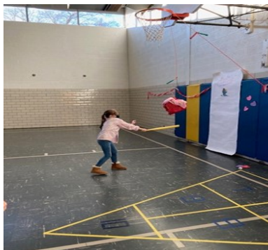
Our preschool kids enjoying time playing in the gym.