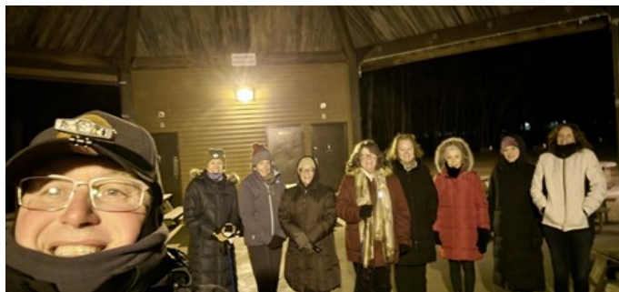
Walk and Wheel ways enjoying a moonlight walk at Nevers Park!

The South Windsor Walk & Wheel Ways (SWW&WW): SWW&WW has been actively working on updating their master plan to accurately reflect where the group currently is and what their priorities, goals and objectives are over the next several of years. Their next meeting will be on Wednesday, March 3 at 7:00pm. RECREATION DIVISION “Feel great – recreate!”