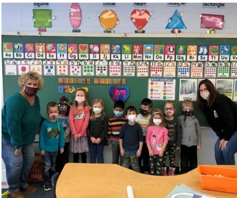
We love our preschool teachers!