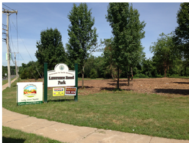
Creating open green spaces at Lawrence Road park