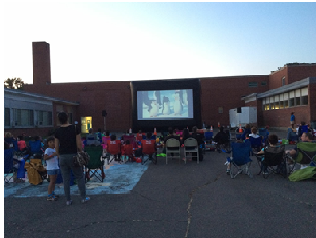
Friday Flicks at Wapping School courtyard as part of July is parks & Rec. month