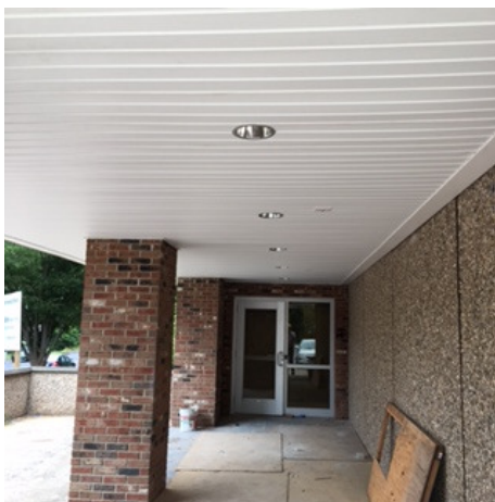
New Ceiling and Lighting at Entryway