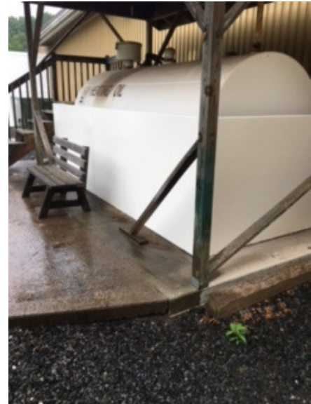
Secondary Containment Tank at Garage