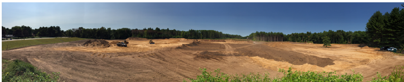
Panoramic view of phase II at Barton Property – finish grading & seeding process.