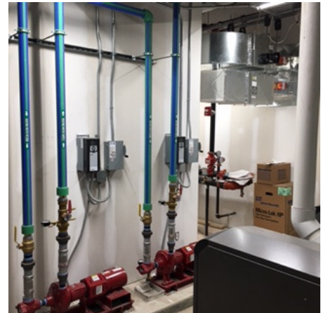
Mechanical Room Equipment Installations