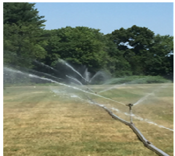
Irrigating the high school front lawn "football" field the old fashion, yet effective, way