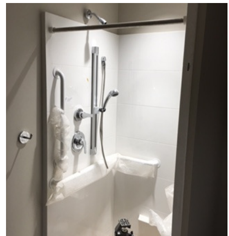
Bathroom Shower Installation in Progress