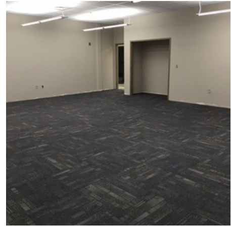
Carpet Tiles Installed in Training Room