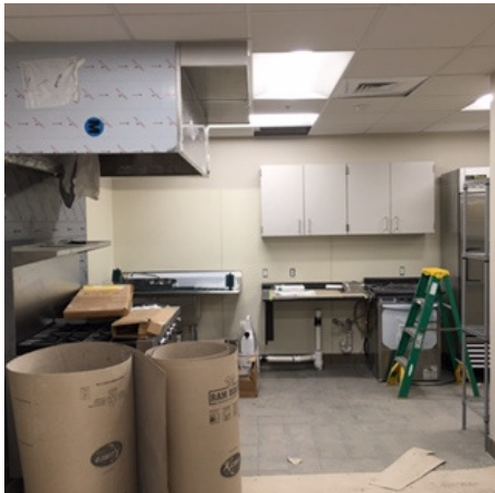
Kitchen Equipment Set in Place