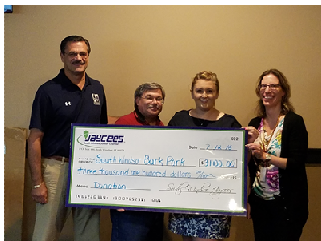
South Windsor Bark Park - $3,100 proceeds from Paws in the Park – 7-12-16 award