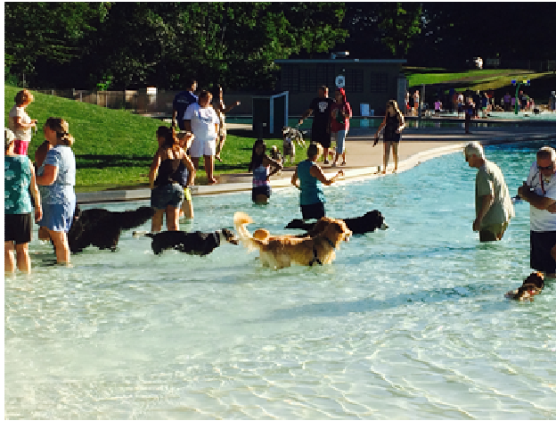
August 29 Pooch Plunge draws a record 225 canines to VMP!!!