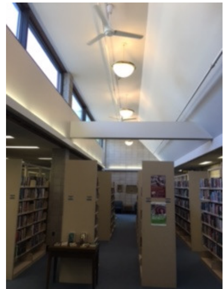
LED retrofitted globe lights at the Library