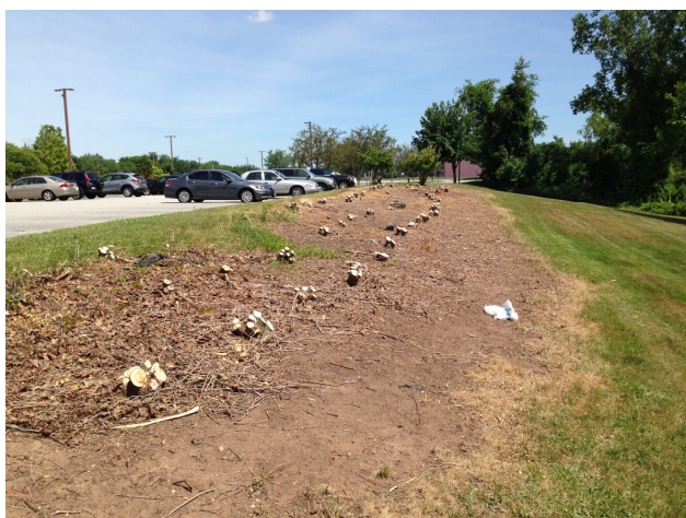
Removal of the burning bushes by the front parking lot at the high school