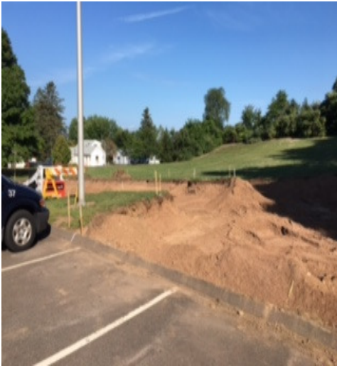
Driveway connector to EOC underway