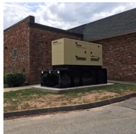
Generator Northeast side of the Building

I've attached photos of the work in progress.