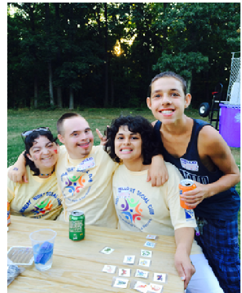
Exuberant participants from our Monday Night Social Club at the annual family picnic at the pavilion sponsored by the SW Rotary Club