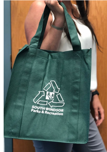
In support of the environment and the new plastic bag Legislation we distributed these fashionable reusable shopping bags to the first 200 folks to claim them at our office