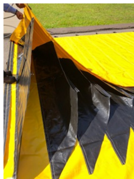
Flood waters fill the space between the top and bottom layers to create 3' of protection.

The fourth and final phase of the Easement Vegetation Management Plan is coming to a close. Over the past four year the Pollution Control Department has methodically been