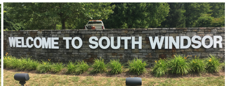
I-291/Rt 5 Gateway signage after restoration