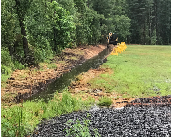
Drainage swale under construction at the Fairgrounds on Brookfield Street to eliminate the recent flooding problem. Again, thanks to our talented parks crew!