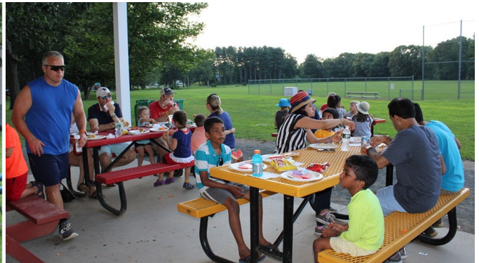
“Roughin’ it at Rye” at our very first and extremely well-received Family Camp Out