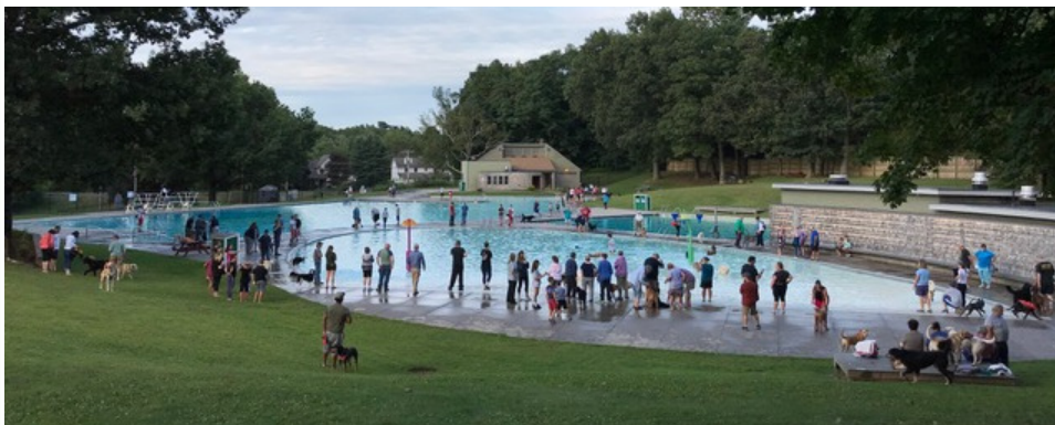
Doggy Dips (formerly Pooch Plunge) 2019 at VMP – again a furry success!!