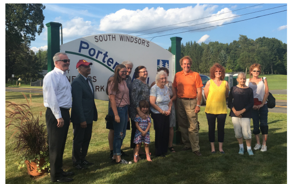
Dedication of Porter's Hill with the Collins Family on a beautiful August 15th evening