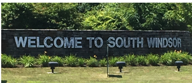
I-291/Rt 5 Gateway signage before restoration