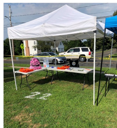
Photo: Government booth set up at the Farmers Market promoting recycling efforts.

This year Town staff has reserved a government booth at the South Windsor Farmer's Market. In July the Pollution Control Department had recycling information available along with reusable grocery bags for interested residents. We received a strong turnout that allowed us to distribute important information.