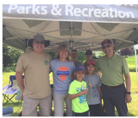
SW Walk & Wheel Ways with assistance from Mayor Paterna at CT Trails Day celebration at Wapping Park on Sun., June 2