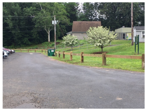
Installed heavy-duty wooden guard rails at the indoor batting building to better delineate parking from lawn areas at parking lot and provide a more secure safety barrier/separation of vehicular and pedestrian traffic and prevent unauthorized parking. Also replaced the post and rail fence with the same guard rail system at VMP.