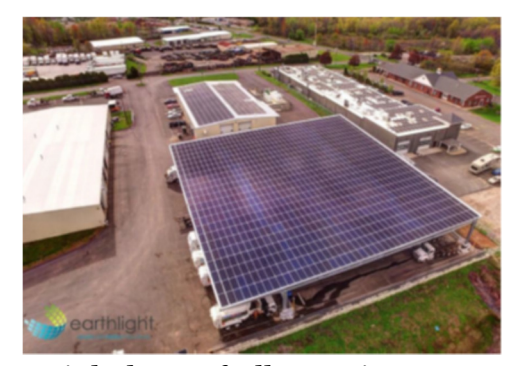
Aerial photo of All American Waste

gas. The compressed natural gas-powered vehicles emit 90% less pollutants and reduce CO2 emissions by 16% as compared to traditional diesel trucks. The solar panels will provide enough energy to power the compressors to fuel the vehicles. All American Waste is planning to expand their fleet of natural gas powered trucks to 100 by 2020.