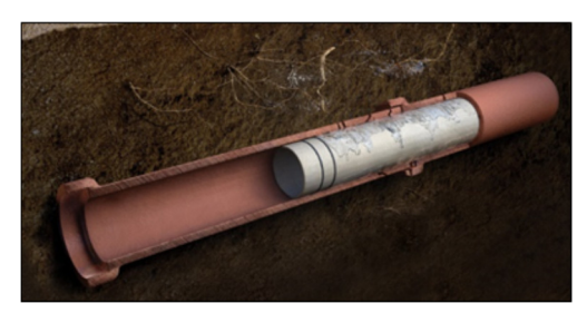
Illustration of Cure-in-Place Pipe

CIPP is a trenchless technology that will renew the life expectancy of the sewer pipe and typically costs 25-30% less than traditional pipe replacement. Phase 2 has been broken up into two projects that are scheduled for this year and next year respectfully. At an anticipated cost of $850,000 each year, Phase 2 will revitalize a total of 4,200 feet of 27"-30" sewer pipe that serves as one of the main sewer trucklines in town conveying 40% of the wastewater flow to the treatment plant.