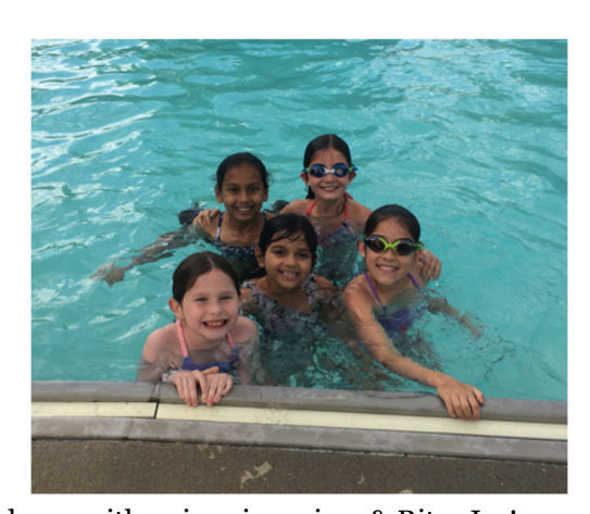
4th R Family Night at VMP – what a way to end the school year with swimming, pizza & Ritas Ice!