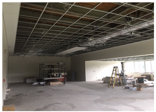
Wapping cafeteria remodeling – new walls are up, rough electrical, A/C and ceiling grid complete.