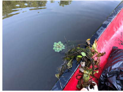
SWW&WW assists with removal of invasive water chestnuts in waterway behind Mill on the River