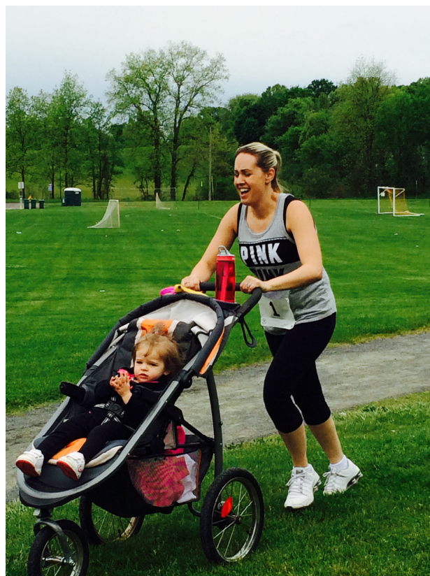
Trails for Charities Day, Journey Found 5K.