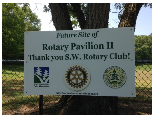
Sign identifying the location of the soon to be built Rotary Pavilion II at VMP. Thank you Gary Schacht!!