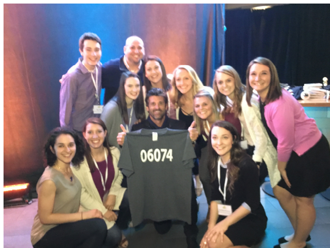
Camp Staff accept the "Sweaty Award" award from TV celebrity/silver screen actor Patrick Dempsey on 5-13-16 in Boston in recognition of their charitable contributions to the Hole in the Wall Gang Camp over the past few years!