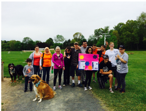
Trails for Charities Day, the Memory Walk for Alzheimer's

growing demand for charitable use of our trails without adversely impacting the general public's use of the park and to deliver it efficiently and frugally. Instead of expending resources singularly every time a group requested exclusive use of the trails we rolled it all into one shared day. Five different organizations were scheduled on the hour as follows: 9:00am—Journey Fund, Manchester (timed 5K run); 10:00am—Pulmonary Fibrosis (walk-a-thon); 11:00am—Alzheimer's (walk-a-thon); 12:00pm—Wapping School PTO (walk-a-thon); 1:00pm—Wapping Community Church (walkers will choose where their collected donations will go to any of ten charities that the church supports). Logistics, staff, signage and entertainment was provided by Parks & Recreation.