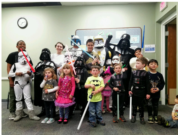
Star Wars fans attend the "May the Fourth Be With You" event on 5/4.

May the Fourth Be With You - Inclement weather didn't deter 30 local Star Wars fans from attending this whimsical special event originally slated for My Friend's Place playground, but moved indoors on Wed., May 4 th from 6:30-8pm. Costumed Star Wars characters mingled with all visitors, posed for photos and enjoyed the music and prizes!