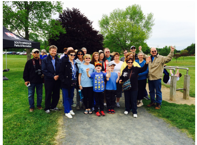
Trails for Charities Day, Walk for Pulmonary Fibrosis

Color Me Grad – This untimed early evening “color run” through the trails at Nevers Park drew a smaller crowd than usual attracting 20 runners. All proceeds benefit South Windsor Operation Graduation.