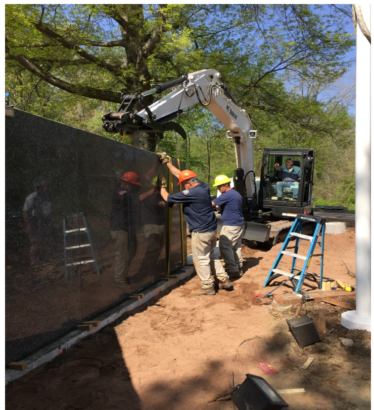
Granite panel installation at Memorial Wall @ VMP