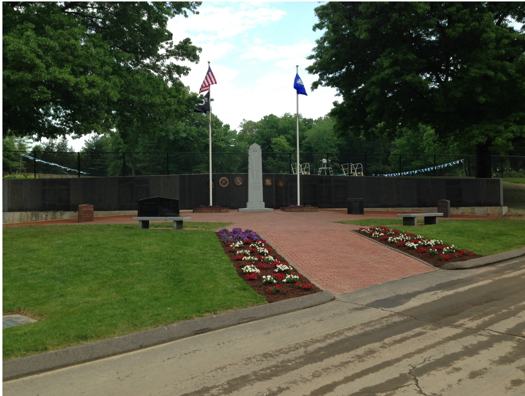
A beautiful Memorial Wall ready for Memorial Day ceremony!