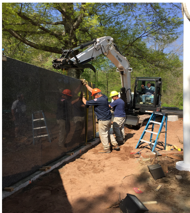
Granite panel installation at Memorial Wall @ VMP