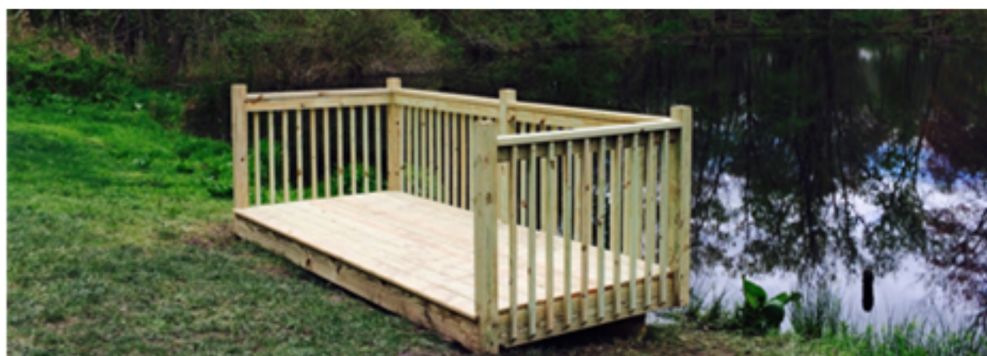
New fishing deck at Lawrence Road Park compliments of Eagle Scout Puida!