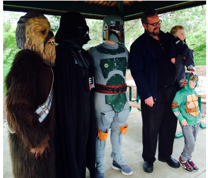
Over 100 children & adults enjoyed “May the Fourth be with You” tribute to Stars Wars at My Friend’s Place, complete with movie characters including an Unbelievable R2D2 replica and fully operational robot!