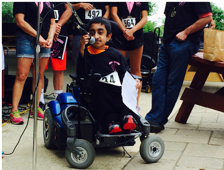
Four groups participated in the Trails for Charities Day. With over 500 total walkers and runners, the combined total raised for the day was over $25,400!