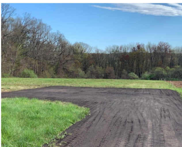
Deming Community Gardens looking good!