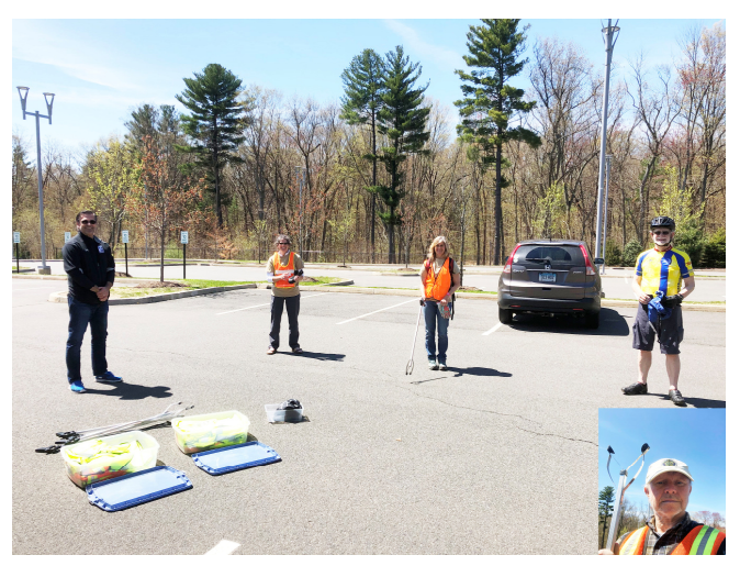
Practicing social distancing and still getting the job done, members of the SW Walk & Wheel Ways (and yours truly) kept their "Adopt-A-Road" promise to pick up trash along Chapel Road on Sat., May 2nd.