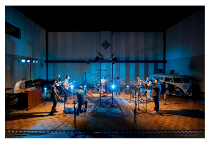
Summer Concerts series will go virtual thanks to a cooperative partnership with local business TELEFUNKEN who will live stream and videotape all of our concerts on schedule as posted for safe viewing from home!