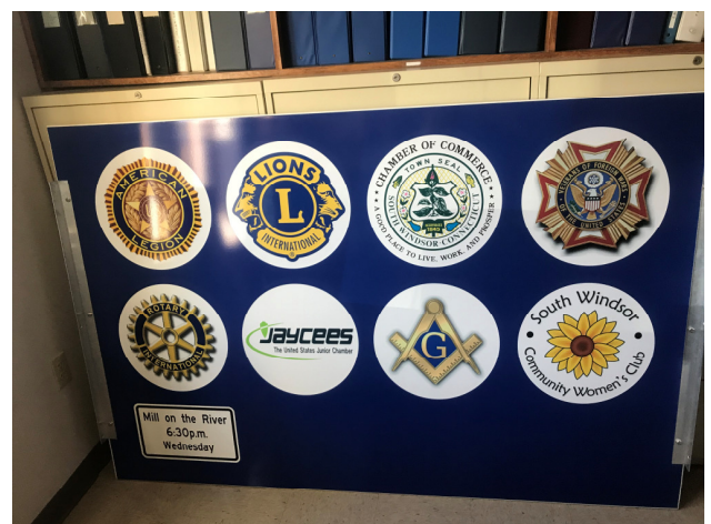
In-house re-designed and fabricated gateway welcome to South Windsor sign on Sullivan Ave. to replace the original one damaged beyond repair in a vehicle accident. We will be looking to refresh the other two in town in the near future.