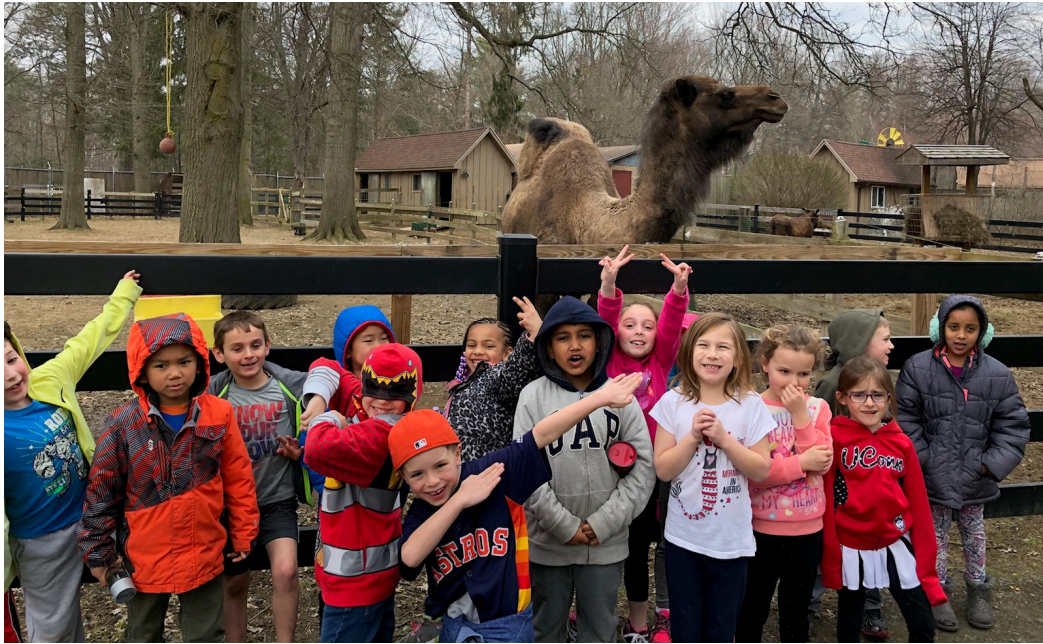
April vacation camp was a super success with approximately 80 kids attending each day. They Enjoyed activities such as a visit from the Manchester K-9 unit, the moon bounce, a sport theme day, and field trips to the Forest Park Zoo as well as a picnic at Wickham Park.