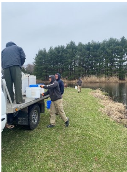
Our crew assisting in unloading the Fish for our derby!