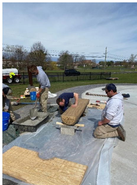
Setting and installing log benches at the splash pad