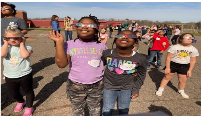
Our vacation camp kiddos viewing the Solar Eclipse