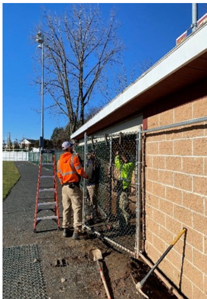
Renovations at Little League and field prep before the start of the season