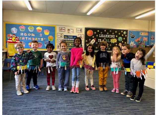
All smiles and excitement in preschool this session