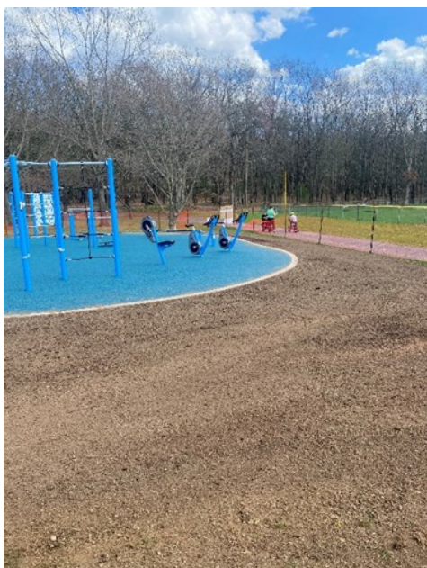
Final touches on the Outdoor Fitness space