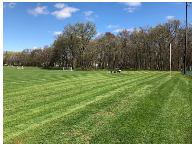
Rye St. Park fields fully prepared for the annual youth boys Robin Klemba Memorial lacrosse tournament on April 27th