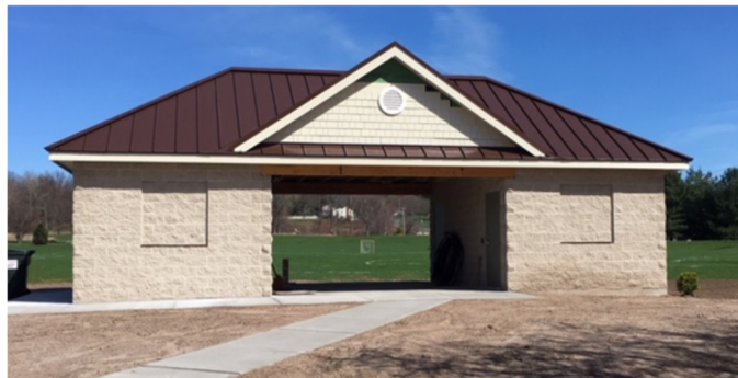
New restroom facility at Nevers Park is nearing completion thanks to a wonderful partnership with the SW Rotary Club