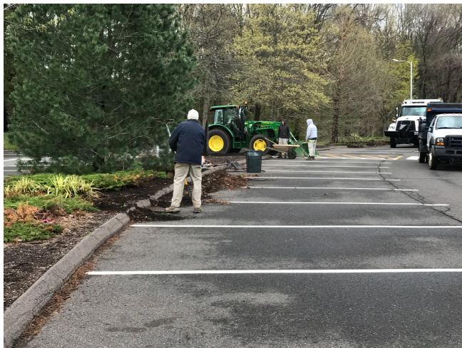
Crew completed an aggressive restoration of the center landscape island at the rear parking lot at Town Hall