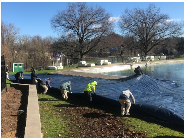
Crew begins the pre-season preparations of the pools at VMP by removing the monstrous covers