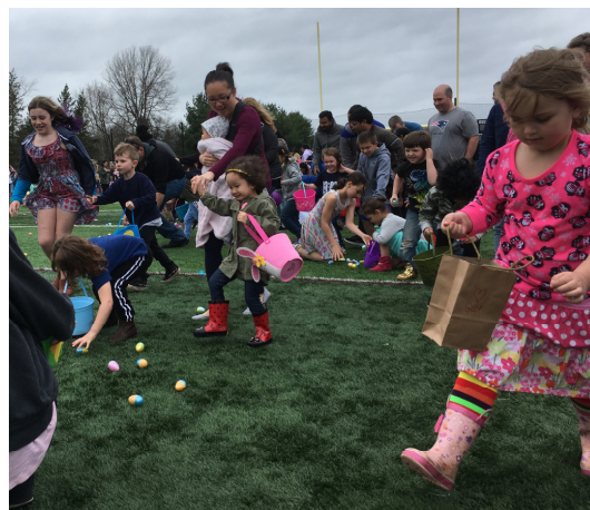
48th Annual Egg Hunt on Fri., April 19th drew nearly 5,000 people!!