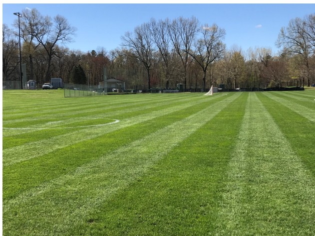
Nevers Park lacrosse fields fully prepared for the annual youth girls lacrosse tournament on April 27th