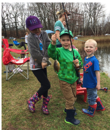
35th Annual Fishing Derby on Sat., April 13th attracted 125 anxious anglers!