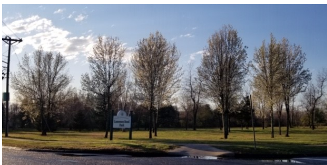
Clearing and beautification at Lawrence Road Park is a continuing work-in-progress