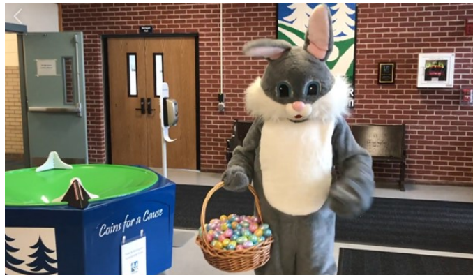
Recreation Inspiration #2 – April 9 – Virtual Egg Hunt with our Spring Bunny!