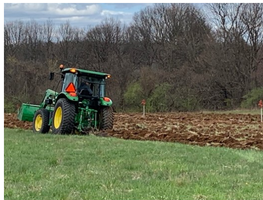
Preparation of new community gardens at Deming Street to be ready for gardeners for the very first time in early May!