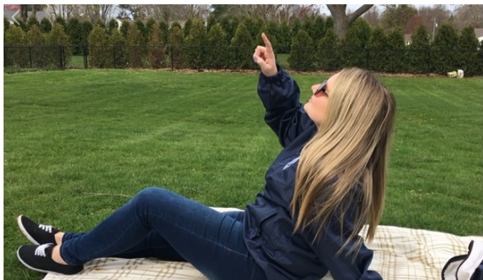
Recreation Inspiration #4 – April 23 - Cloud Gazing Creations!