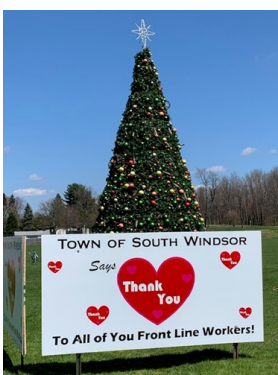
Giving thanks to our local COVID-19 heroes with our "giving tree" at Nevers Park.