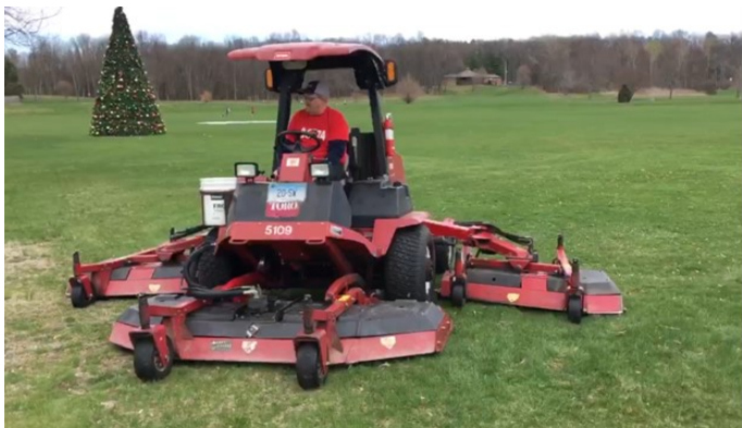
Recreation Inspiration #3 – April 16 – Behind the Scenes Look at our Parks Division!