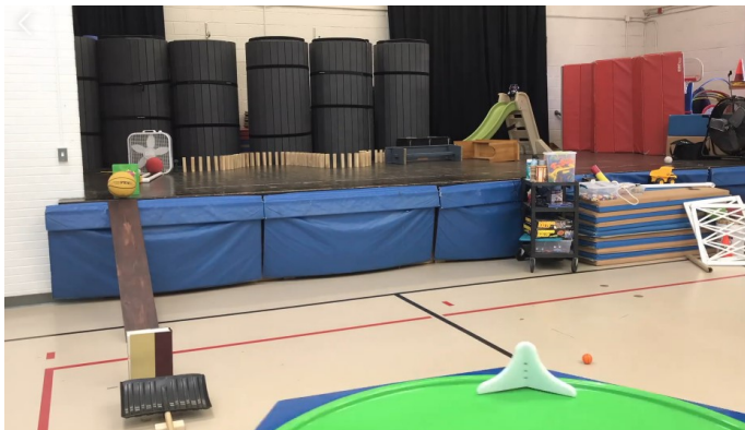
Recreation Inspiration #1 – April 2 – DIY Rube Goldberg Challenge!