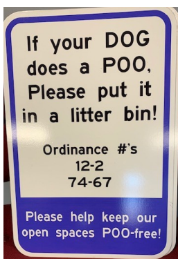
New signage placed at Nevers Park in response to continuous disregard to canine courtesy