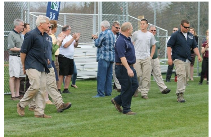
Members of our Parks crew step forward to be recognized for their impressive efforts constructing the new softball field during the dedication ceremony April 22.