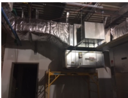
Air Handling Equipment ductwork being installed in mechanical room