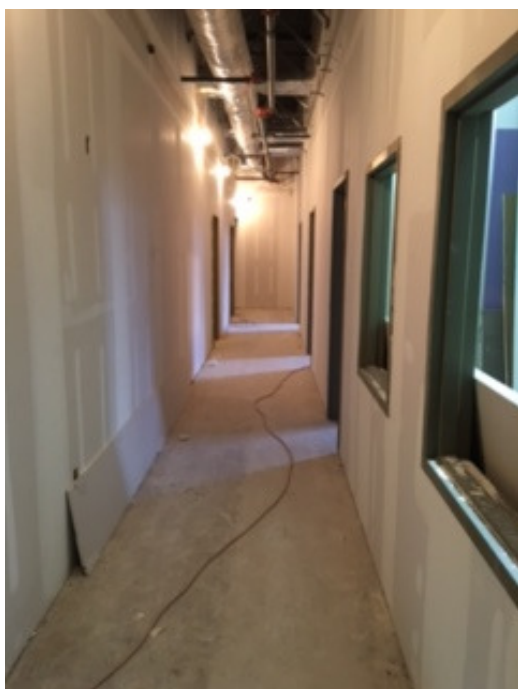
Hallway through administrative offices completely sheetrocked and ready for paint