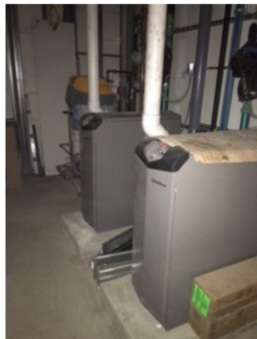
High Efficiency Condensing Gas Boilers being installed

I've attached photos of the work in progress below.