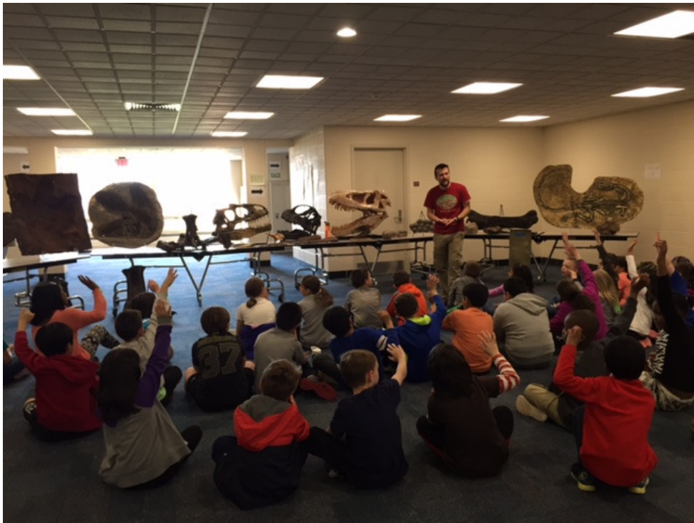
April Vacation camp, an extension of our 4 th R program, accommodated 100 local kids who Enjoyed special art projects, science experiments, earth day activities and dinosaur artifacts.