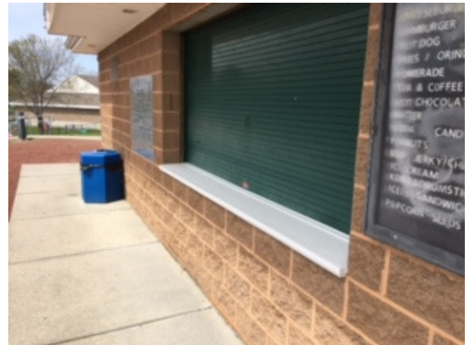
New Serving Window Shelf at the Ralph Giansanti Press Box

Of the one-hundred and seven work order requests we received this month we were only able to close thirty-eight of them. This is due in part to the seasonal site opening duties and an increase in emergency type services where contractors we involved. Since July 1st we've completed 1,323 work orders, our current backlog stands at 252 open work orders.