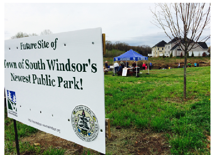
Soon the Dzen Tree Farm Pond property where the Fishing Derby is held will be South Windsor's next public park!