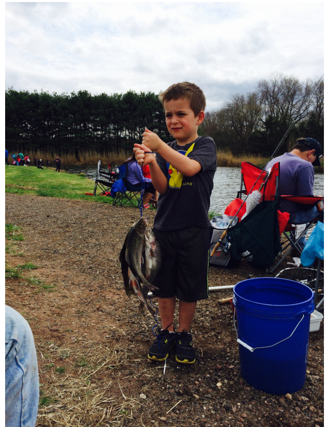
Fishing at the Derby is for everyone – some more successful than others, but all smiles!