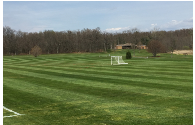
Nevers Park soccer/lacrosse fields ready for the Spring season