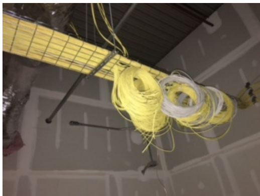
Ethernet, and video and security cabling in cable tray above ceiling