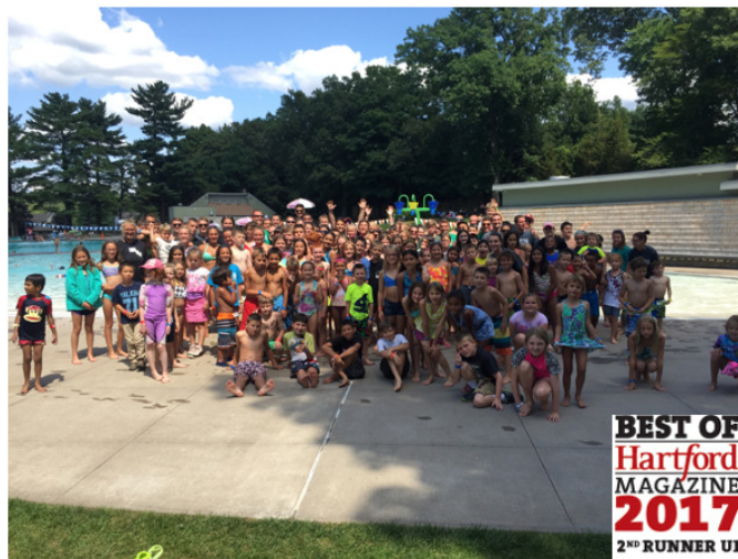
High Five! SWPRD 2nd Runner Up in the Summer Camp category