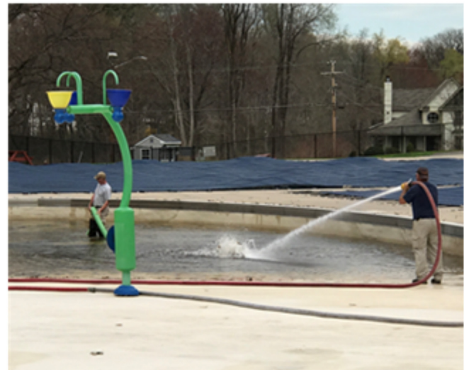
Crew begins pool cleaning at VMP