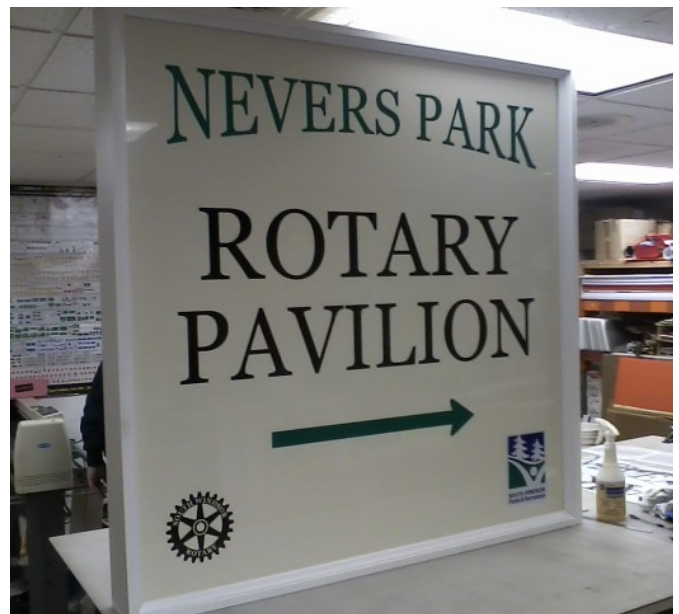
New entrance sign to Rotary Pavilion