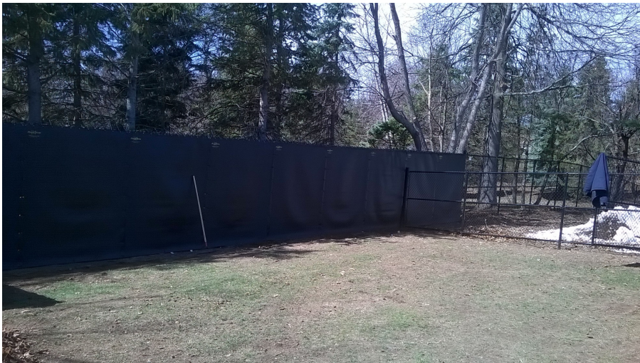
Property line fence project under construction at the high school stadium