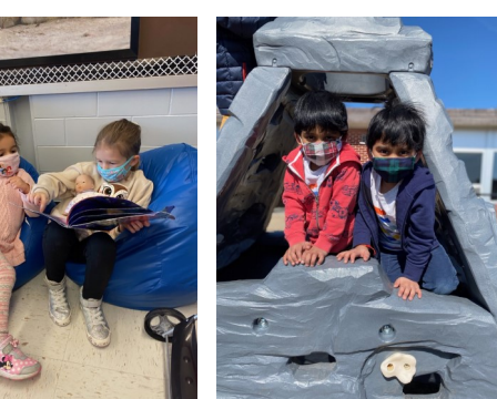
Enjoying the spring weather!