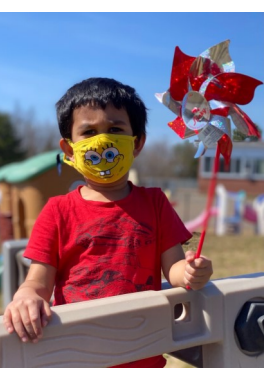
Celebrating St. Patrick's Day!