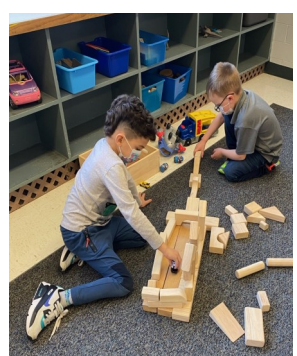
Building and playing with new friends!