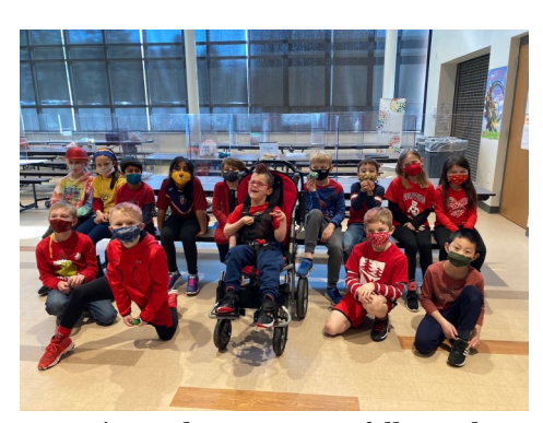
Wearing red to support a fellow 4th R member to raise awareness for the rare disease PKAN.