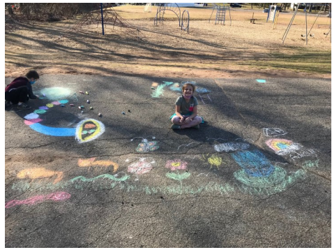
Creating spring themed drawings!