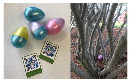
600 hidden eggs with QR codes in our town parks!