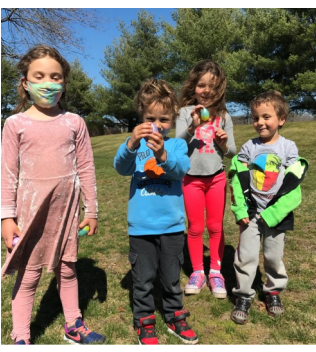
Some happy egg hunters! They found a few winning eggs outside of Wapping.