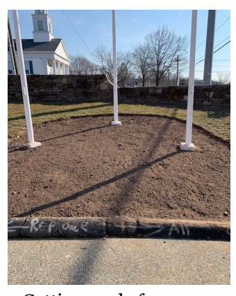
Getting ready for a new patio style base for the new flag poles at the South Windsor Four Corners