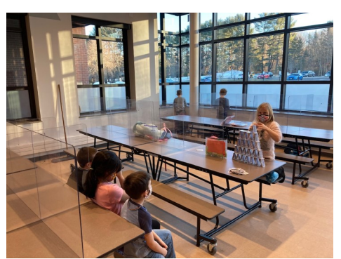
"House of cards" building skills.