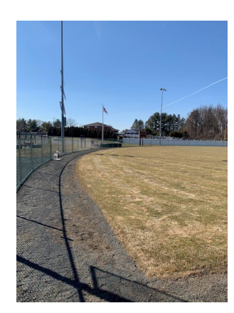
New 6-foot fencing, warning track, and bull pen areas installed by SW parks crew.