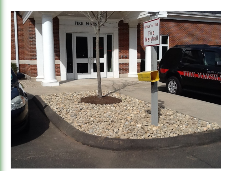
Fire House 3 gets some TLC