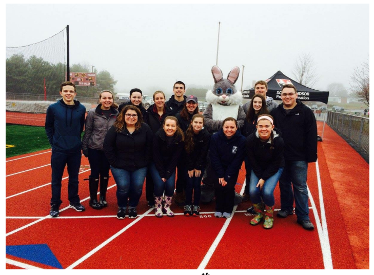
Volunteers make it (45<sup>th</sup> annual egg hunt) happen!!!!