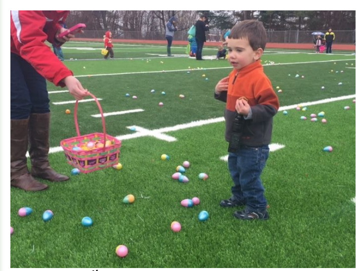
45th Annual Egg Hunt at its best!!

Our summer camp counselors were nominated for an award through The Hole in the Wall Gang Camp for Run4Camp! Last year, our donation was matched with an organization called Positive Tracks. Positive Tracks holds an annual award ceremony, "The Sweatys", where 13 charitable partners (The Hole in the Wall Gang Camp being one of them) nominate one of their notable donators. They picked us! The ceremony is in May 6th at Fenway Park and 2 out of the 13 nominees will receive an award! Good luck SW P&R camps!!