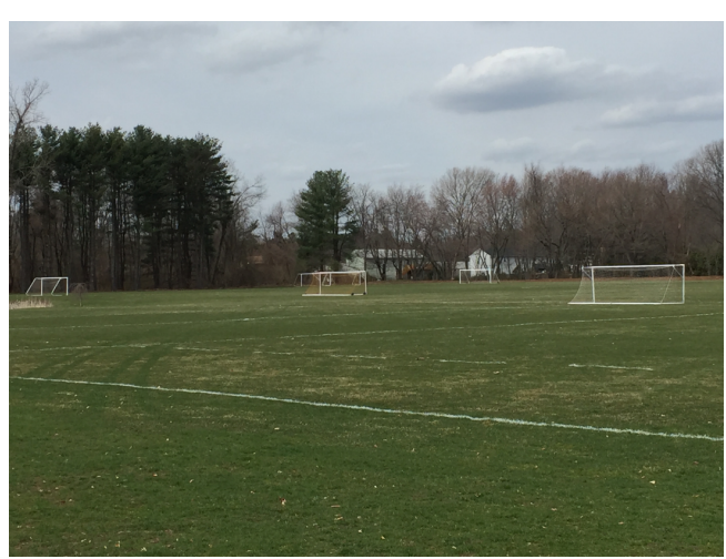
Soccer fields at Rye Street Park ready for youth little kickers