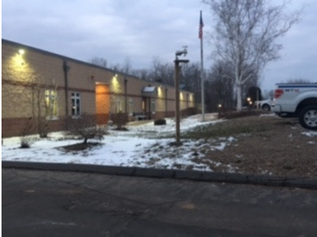
LED lighting Upgrades at Town Garage

done until more of the salt has been dispersed so that an articulating lift can be brought in to reach the interior lighting.