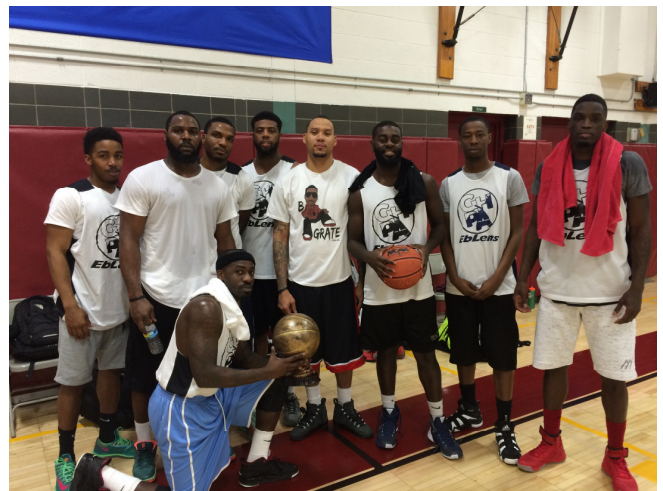
Men's A Division basketball. Amerikaz Nightmare defeated the Dynasty at SWHS on 2/27