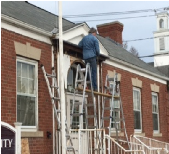
Contractors removing trim and doors

A new card access system similar to what the other town buildings are currently using is scheduled to be installed at the fitness center in the next month. The existing system was