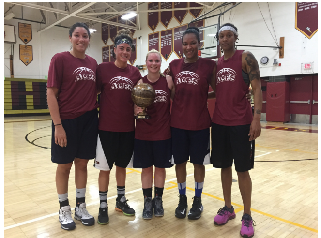
The Aces defeated the Bricklayers 49-39 in the Women's Basketball Championship held at SWHS on 2/20