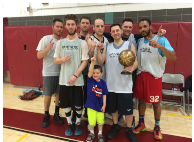
Men's B Division basketball. Gang Green defeated the Boozers at SWHS on 2/27