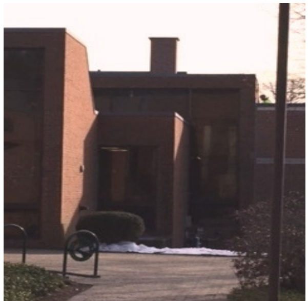
After chimney installation