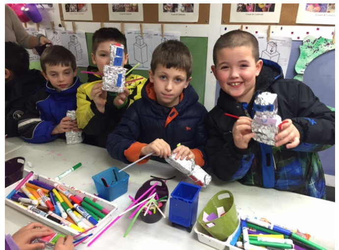
The mobile "Art Truck" visited each of the five 4th "R" sites this month providing novel art projects worked on inside the truck instead of the school! Kids had fun, and the parents loved that their kids had fun!