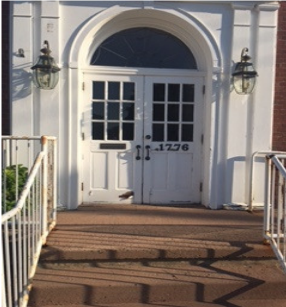
Wapping Community House Original doors

painting once the weather breaks. The trim, door and window are made from maintenance free PVC material that should last for many years to come.