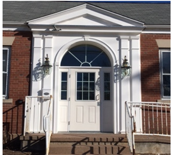
New door and trim completed

A new card access system similar to what the other town buildings are currently using is scheduled to be installed at the fitness center in the next month. The existing system was