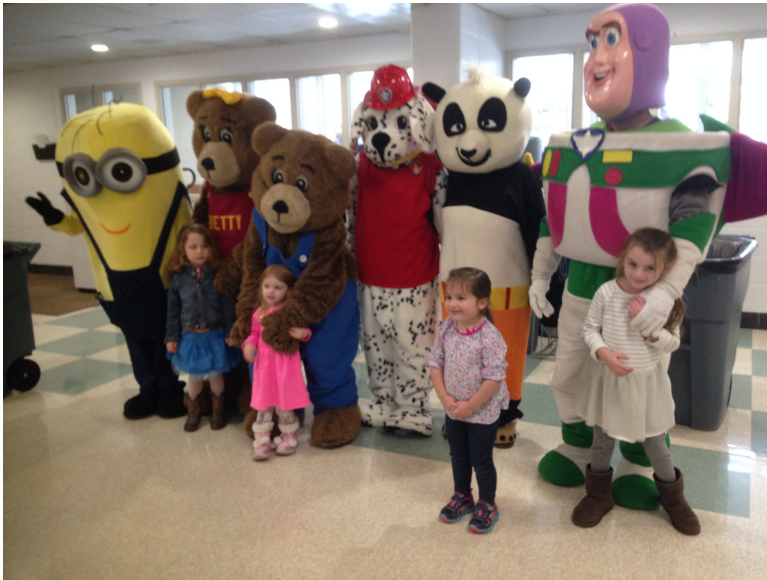
We caught these six "characters" having way too much fun on Feb. 11 at TEMS during our Cartoon Character Ice Cream Sundae Social. Students from the SWHS InterAct Club volunteered their time to play the "costumed roles". Judging from the smiles, the kids had fun too!