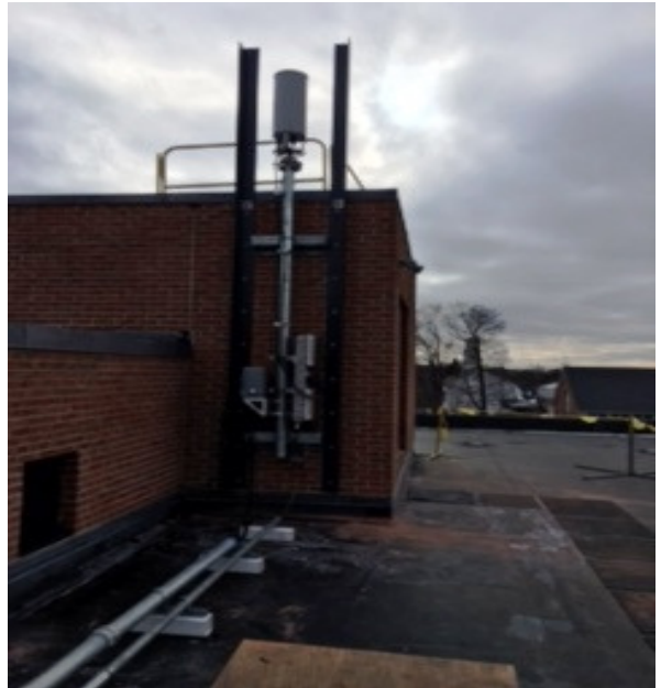
Verizon Antenna Prior to Faux Chimney