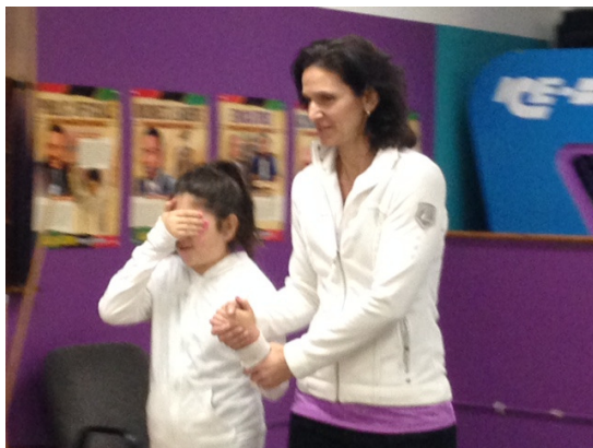
A mother/daughter duo participating in the activity "trust walk"

The Mother Daughter Circle started in February. We have 5 mother daughter couples participating in relationship building activities and having fun. Our last session will be in March. Our Youth & Family Counselor, Eileen Adler is co-facilitating this group.