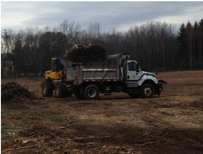
In-house preliminary site work, primarily stump removal, is nearing completion in preparation for the building of the berm at the Barton Property