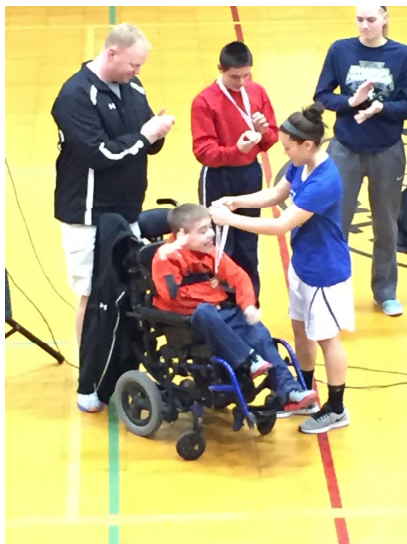
Challenger basketball awards ceremony at the basketball extravaganza on February 20 th at TEMS.