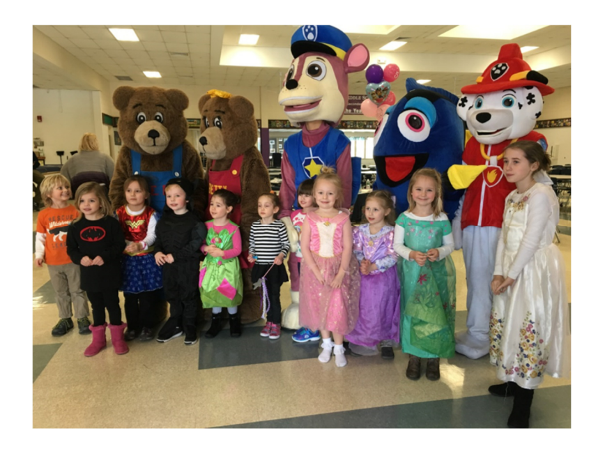
Cartoon Character Ice Cream Social at TEMS on Thursday, Feb. 16th keeps local youngsters busy during school vacation