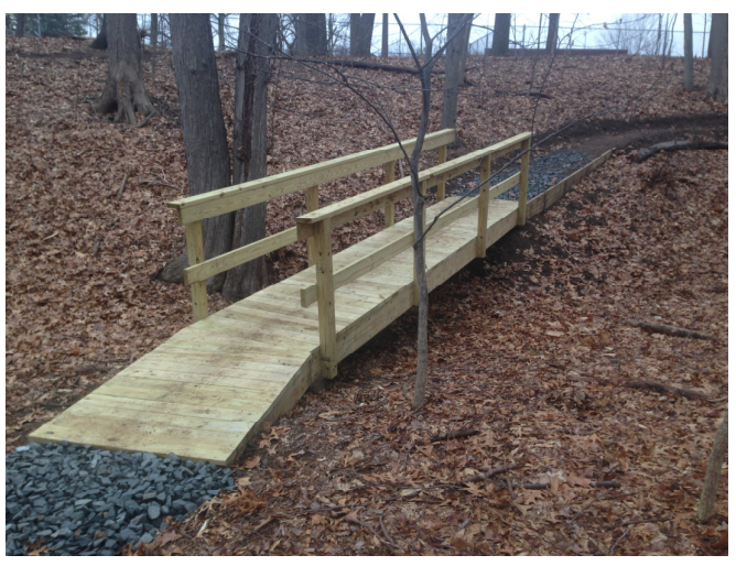
Gulley bridge at new violet beginner mountain bike trail at Rye St. Park