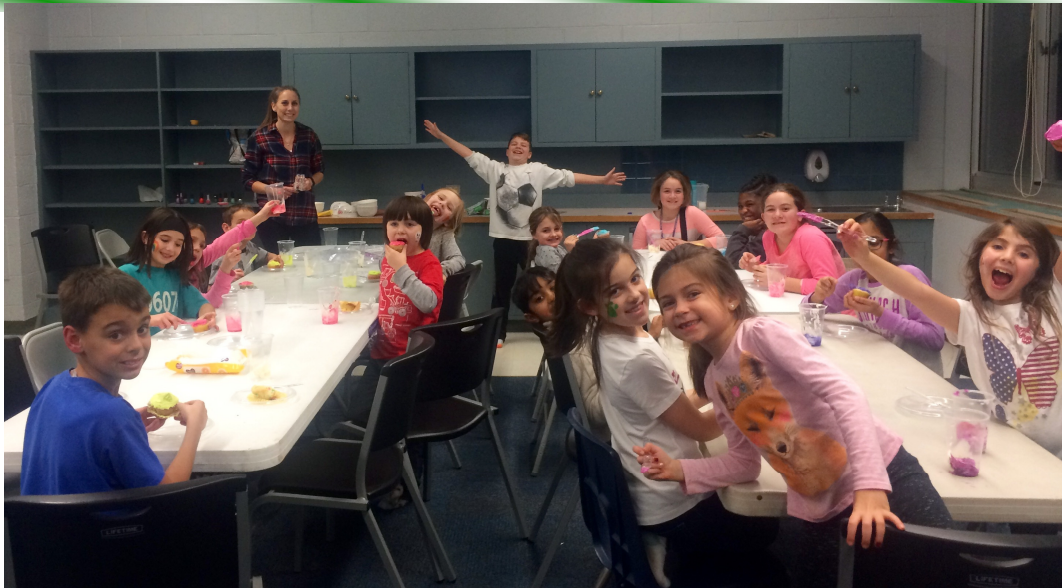
All smiles on Kids Night Out (sans parental units) on Friday January 26th