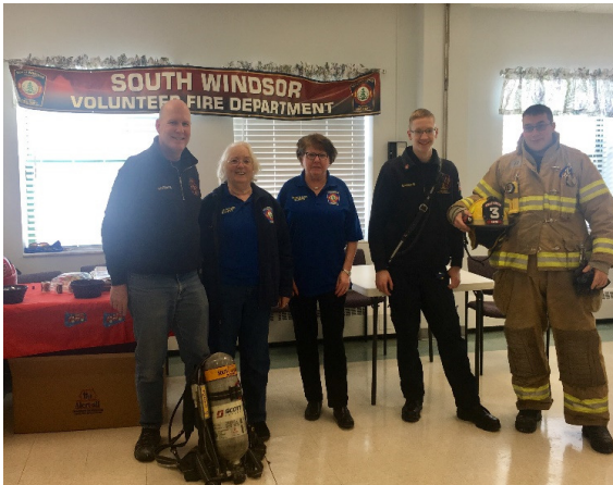
South Windsor Fire Department provided Fire Safety Tips and demonstrations