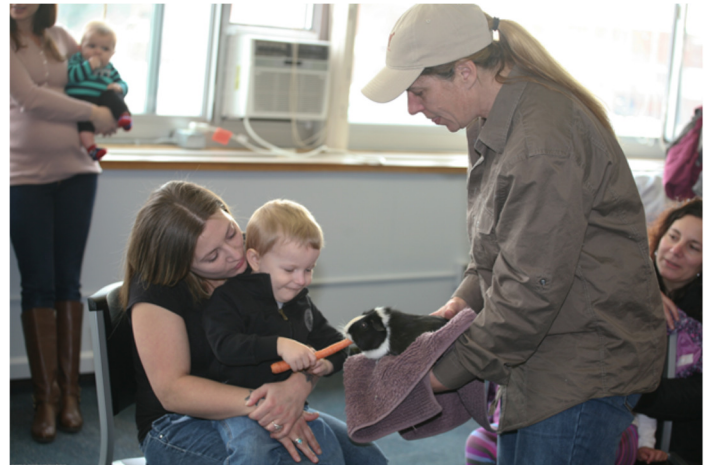
Staff from "Critter Caravan" provided hands on engagement with a variety of animals from guinea pigs to snakes!