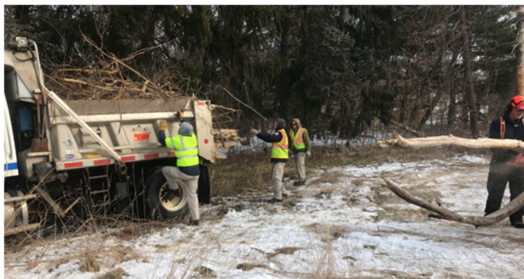
Above: Parks crew members continue to clear deadwood, invasives, hazardous and diseased trees at Lawrence Road Park in between snow storms.