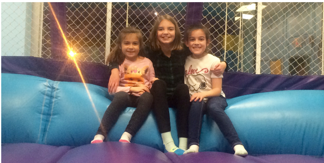
Bounce House is a big “pre-cupcake” hit at Kids Night Out