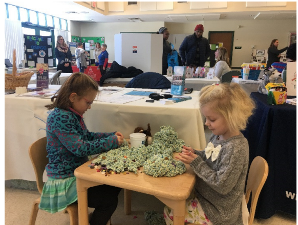
Hands on Children's activities

hearing screenings. The South Windsor Lion's Club Kidsight program screened over 30 children and identified 4 children as needing a referral for follow-up. Because of the event the Kidsight program connected with several