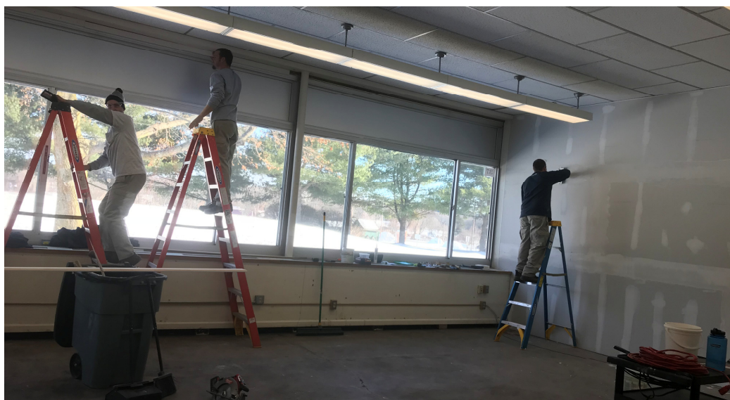
Parks crew renovating room 37 into a fitness class room at Wapping. Lower photo is Hales Flooring installing rubber floor.