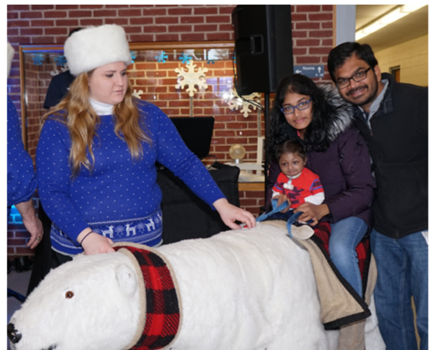
Right: Safari Rides staff guides Lucy the life-size mechanical polar bear through the halls of Wapping