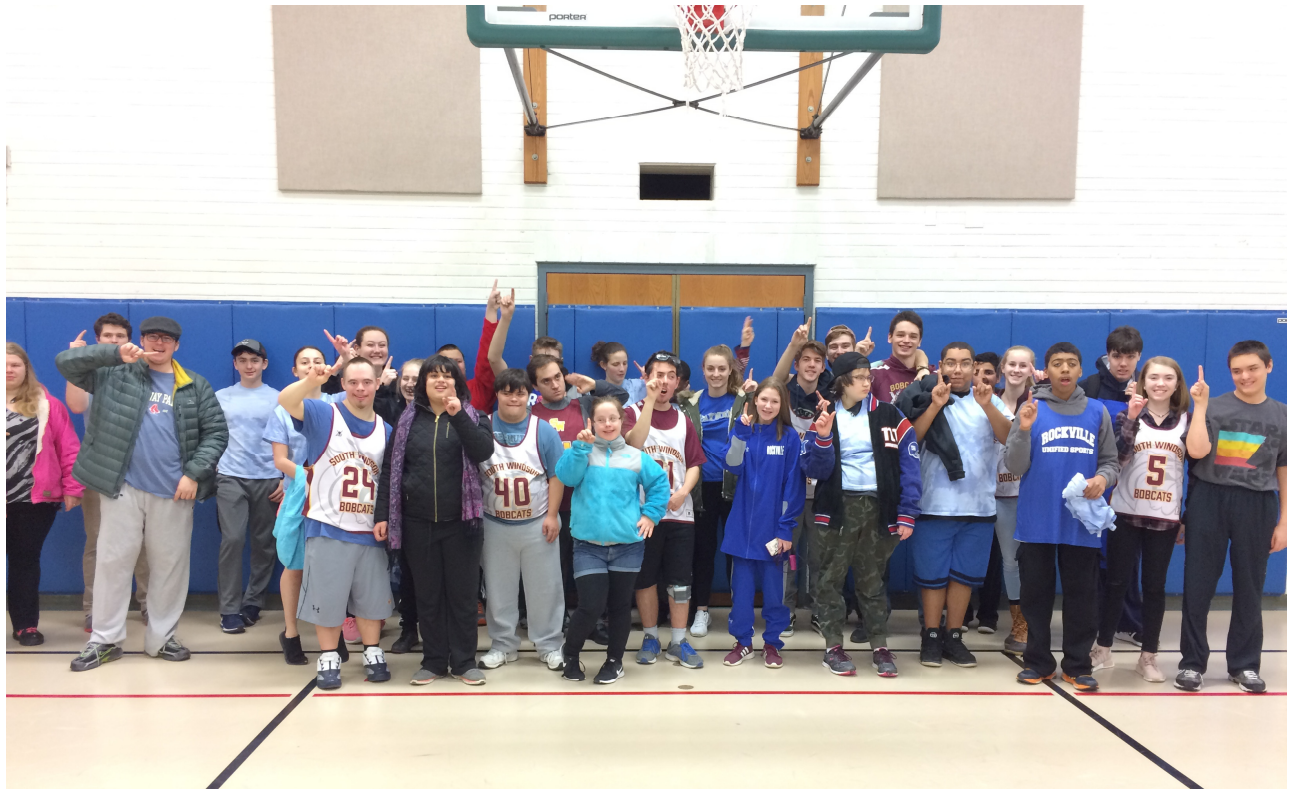
Top and below left: Parks & Rec. was proud to host the SWHS Unified Basketball team at Wapping gym for their latest game versus Rockville High