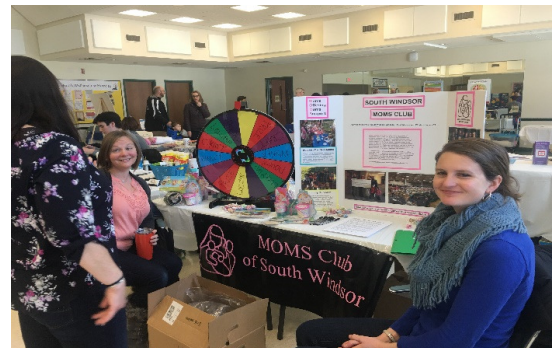
Over 35 vendors participated!

childcare centers in town and will begin doing yearly screens in the childcare centers. The South Windsor Fire Department provided fire safety tips and demonstrations to children on how to Stop, Drop and Roll!