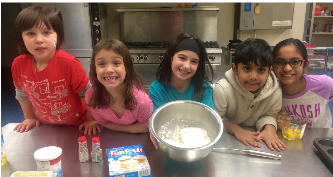
Kid-made, home-made cupcakes at Kids Night Out