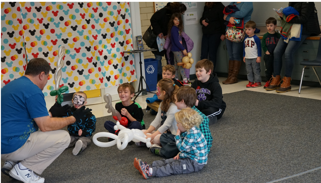
Above: Magic shows captivated young audiences all day!