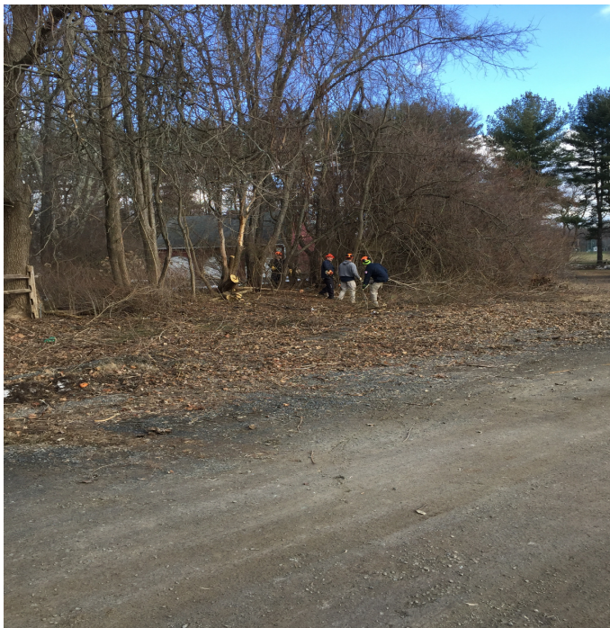
Crew members clearing invasives along the gravel lot by the basketball court at Rye Street Park