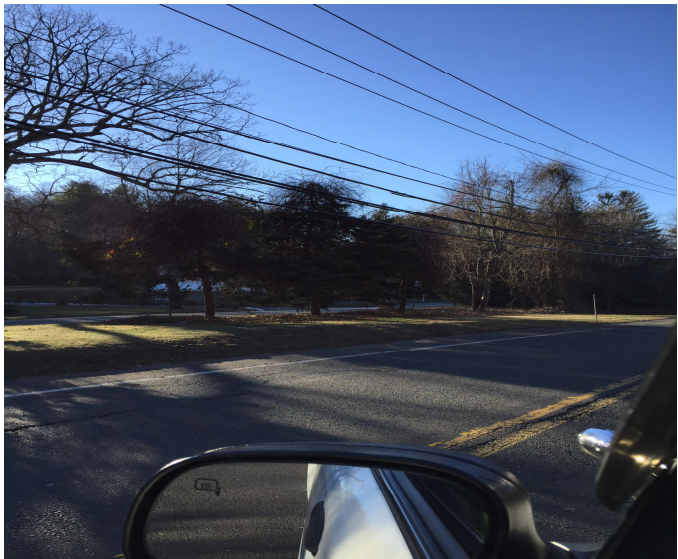
Spruced up island at Deming and Oakland entering town from Manchester