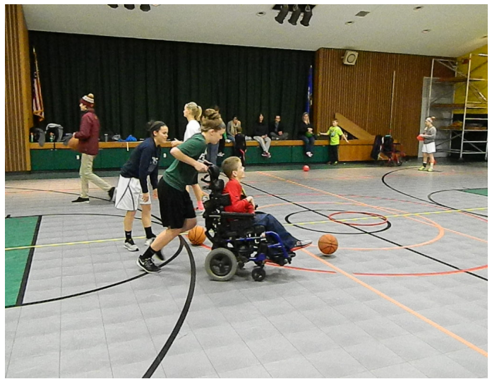
Our Challenger basketball program provides the opportunity for local youth with special needs to experience basketball with a partnered volunteer "buddy" from the SW High School boys' and girls' varsity basketball teams at the Eli Terry gym on Saturday mornings.