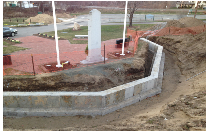
Installation of the foundation was step one of the new Memorial Wall project at VMP

The line of pine trees to the left (south of the property entrance) were to serve as a buffer along Brookfield Street until they began to uproot following the clearing of the Barton Property. For safety reasons, they were all removed and will be replaced with an earthen berm and new trees.