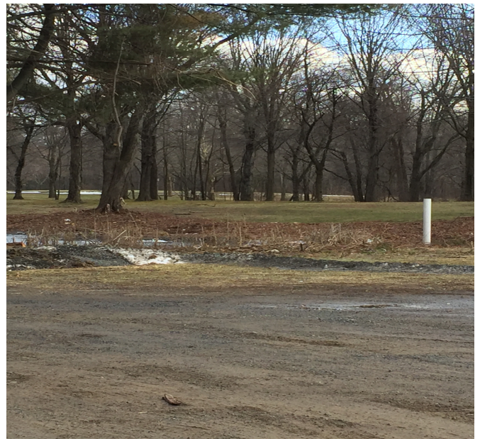
Beginning to see the pond at Rye Street Park once again!