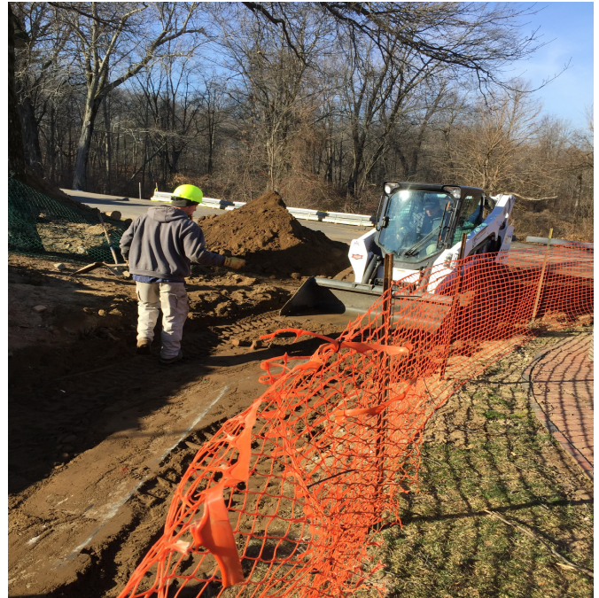
Step two - Back-filling the Memorial Wall foundation by parks crew members