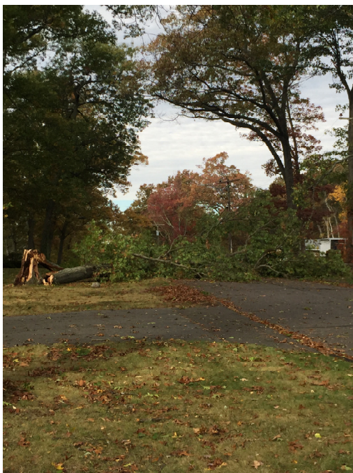
Tree Across Birch

Here at the Public Works Street Services Division we have been ramping up for and kicking off the leaf season. This year proves again to be unique with many of the leaves still in the trees nearly half way through November. What makes this peculiar this year is the major wind event experienced at the end of October.