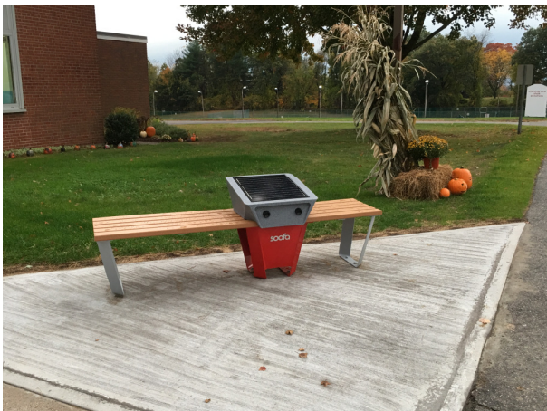
Above: New solar-powered smart device charging station at Wapping!