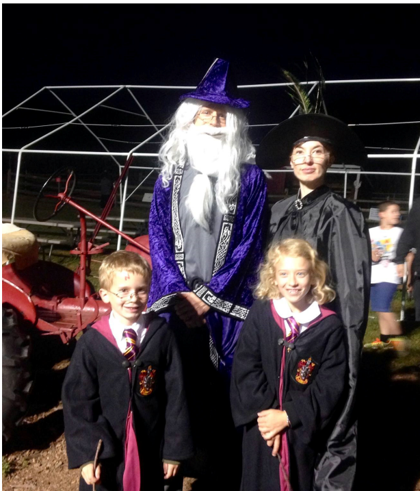
4th "R" Annual Fall Family Night at Foster Farms