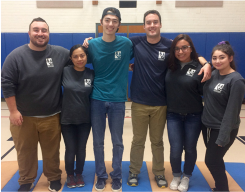
Left: Pleasant Valley 4th R Staff