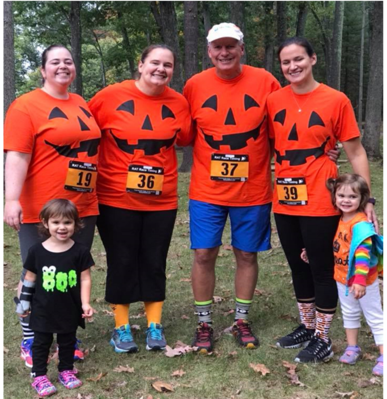
Fall Fest 2017