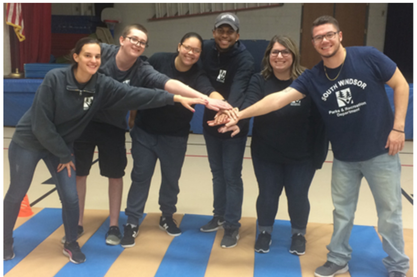
Right: Orchard Hill 4th R Staff