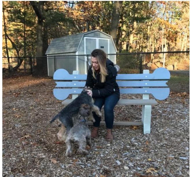
10th Anniversary of the Bark Park was celebrated on Sun. Nov. 19th highlighted by the addition of new features like this dog bone bench and climbing obstacle designed, built and installed by our talented parks crew!