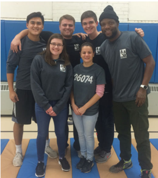
Left: Eli Terry 4th R Staff