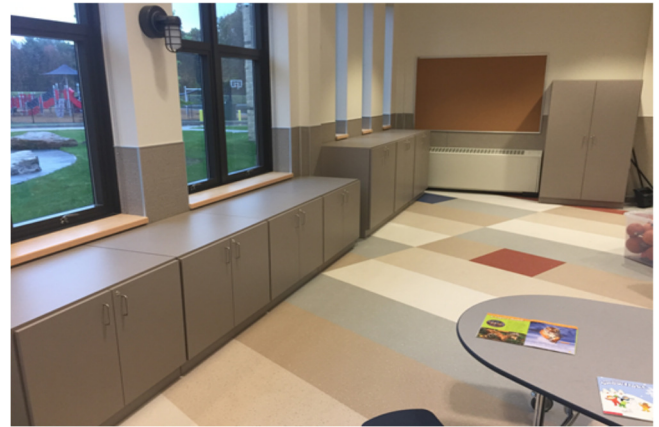
New custom built cabinetry for the 4th R program at the new Orchard Hill School site