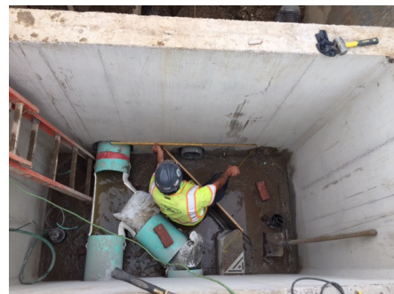
Photo: Sullivan Avenue Siphon inlet structure being built.

town. Over the years upstream development has increased the wastewater flow which in turn has maximized the high flow capacity of the siphon that runs under the Podunk River. The contractor will be adding a third siphon pipe and install a 12" sewer from Troy Road to Hillside Drive. Increasing the sewer capacity will mitigate surcharging and will allow development to continue east of the Sullivan Avenue water shed. We are addressing the traffic issues that this project has created by utilizing extra flaggers when necessary and keeping two lanes open as much as possible. An open line of communication with the business community has been established and we are reinforcing the long term benefits of this project for their businesses.