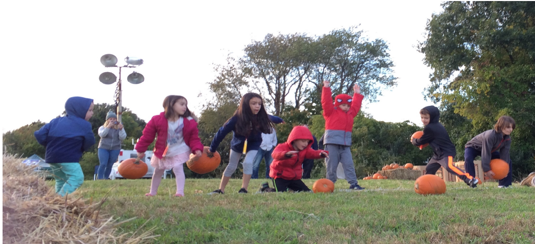
Porters on Porter's Hill Pumpkin Roll Highlights – what a great new addition to our park system!