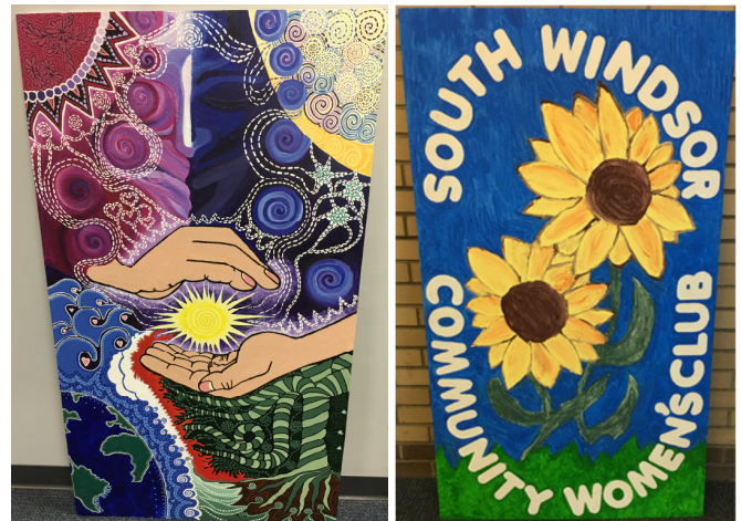
Two more beautifully done window coverings for the Priest farm house!!