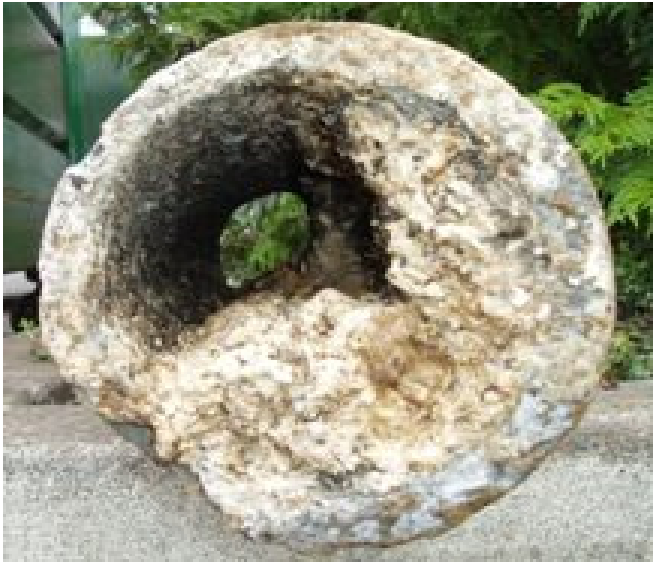
Result of Grease in Sewer Pipe

You can find more information about the Water Pollution Control Facility and the Water Pollution Control Authority on the Town of South Windsor's website at www.southwindsor.org .