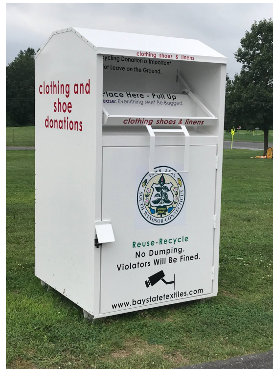
Textile Recycling Container

Our textile recycling program began in September. We took delivery of our first recycling container and have added 6 more around town. There is one container located at each school, one at the Community Center on Nevers Road near the playground and one at the Recreation office (formerly Wapping School) located on Ayers Road. We have recycled 5,700 pounds of textiles as of October 31 st . Acceptable items that are being collected include footwear, clothing, linens, pillows and stuffed animals. These items can be in any condition.