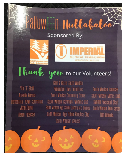
Tremendous community volunteer support for HallowEEEn Hullabaloo!!