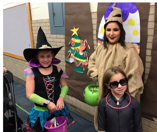
509 youth and 534 adult Trick or Treaters invaded Wapping for HallowEEEn Hullabaloo