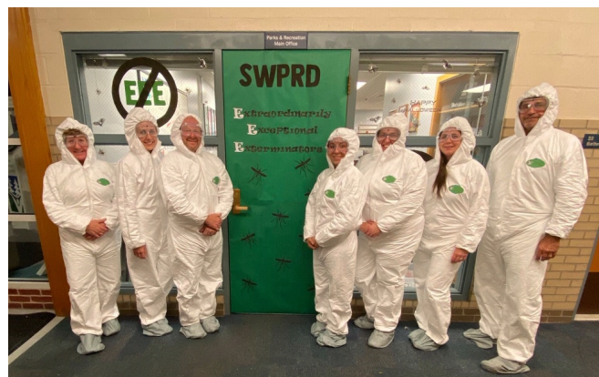
Your Extraordinarily Exceptional Exterminators from SWPRD to save the day at HallowEEEn Hullabaloo!