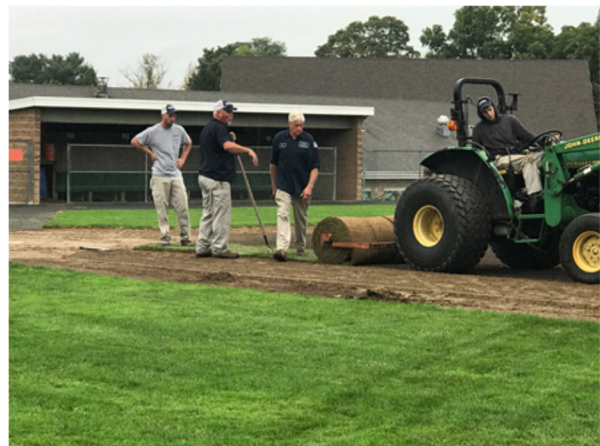
Rotary Baseball Field infield was rebuilt/ regraded and fresh sod installed