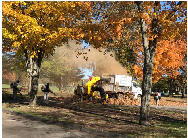
Fall leaf clean up at Rye Street Park