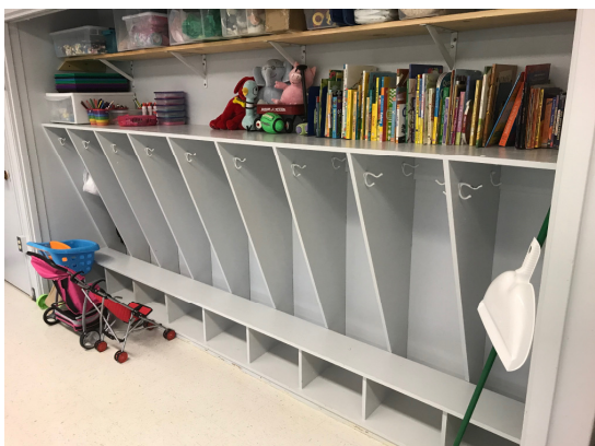
Before modification to remove potential entrapment in preschool rooms