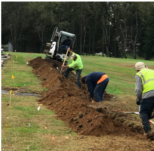
Cox Cable installation at Wapping