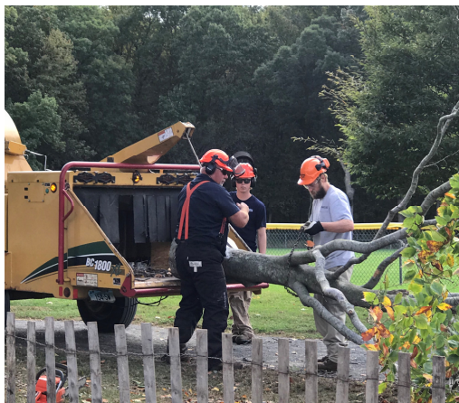
October storm tree work and clean up