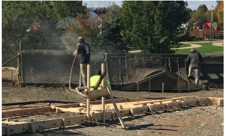
Skate park Phase II under construction – this time with all poured-in-place “shotcrete”.