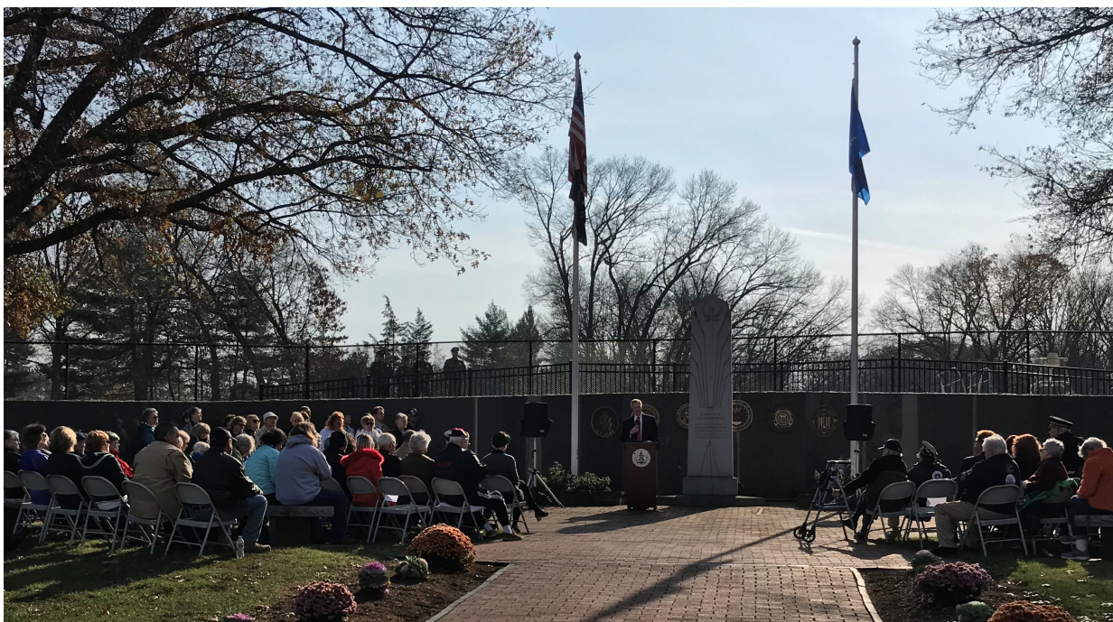
Veterans Day Ceremony at VMP – the “11th day of the 11th month at the 11th hour”