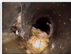
Photo: These images were taken by the WPC staff using a CCTV inspection camera on Griffin Rd. The sewer pipe is failing and beginning to collapse.