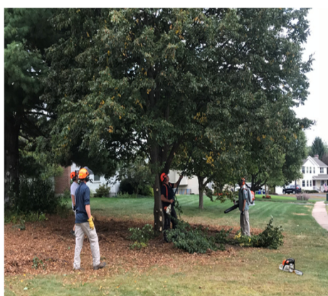
Open space tree work in action