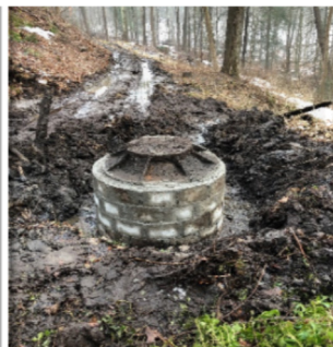
Photo: This manhole located on a cross country sewer line between McGrath Rd. and Rye St. was buried over 2 feet below the surface.

During a routine inspection of a sewer pipe in Griffin Road our staff discovered a section that was partially collapsed and in need of repair. The pipe in this area of town was installed 1973 and is approximately 46 years old. This discovery highlights the need for continued maintenance and re-investing money back into our sewer systems infrastructure to provide uninterrupted service and environmental stewardship. The cost of emergency maintenance is estimated to be 10 times the cost of preventative maintenance. The WPCA maintains the understanding of these principles by committing the appropriate resources to the capital improvement budget.