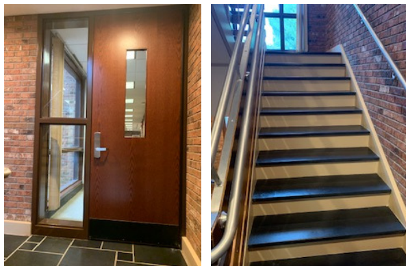
Freshly Painted Door Frames & Stair Risers at Town Hall