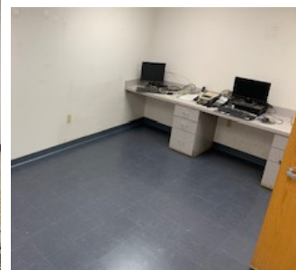
New VCT flooring in Mechanics Offices