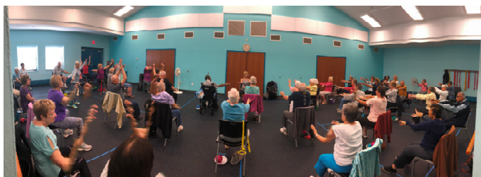
Packed house...over 50 people in one class!