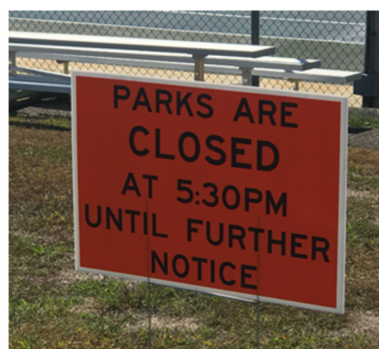
EEE threat forces park closures. 45 signs made & posted within 24 hours