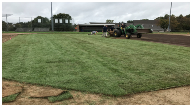
In-house re-construction of Rotary Baseball infield