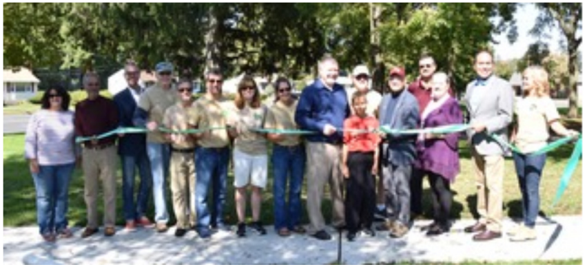
Official "Ribbon Tying" symbolizing connecting community