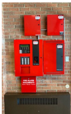
New Library Fire Alarm System