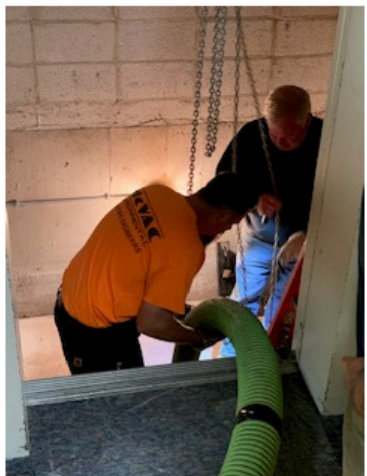
Elevator Work Underway