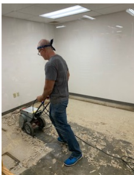
VCT Tile Removal Town Garage Offices