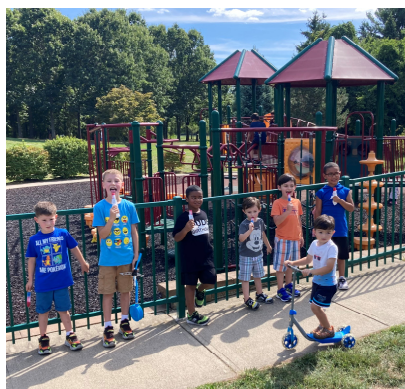
Nothing like Pop-Up Ice Cream in the Parks on a sunny Saturday at My Friends Place!