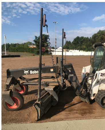
Lazer grading the Pepin Little League field

Irrigation system was installed and turf areas were Brillion seeded in multiple directions topped with hydro-seed – and the grass is popping very nicely! Stumps along the private property line were removed and will be replaced with a row of 25 8-10 foot high arborvitae to re-establish a privacy buffer for the neighbor to the west. Installation of permanent new chain link fencing is the last remaining item. Field should be ready for next Spring! This is the forth athletic field we have re-constructed primarily in-house in the past 8 years. The other were: the Ayers Road Softball field. The TEMS Baseball field and the SWHS multiple purpose field.