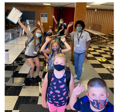
Smiling Pleasant Valley 4th "R" – can't you tell?!?