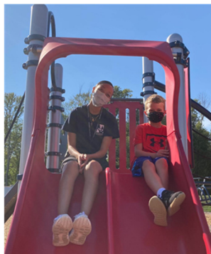
Orchard Hill 4th “R” crafty indoors and drafty outdoors!

Being One of the Best! – By now you have probably heard that on September 23rd Money Magazine publicized 2020’s list of the top 50 “Best Places to Live in the U.S.” and South Windsor ranked an amazing 12th in the country!! Selection criteria was based on communities “that aren’t just doing well now, but show great promise and stability for the next five to ten years.” Additionally, the magazine touted our historic district, availability of farm fresh produce, proximity to large stable employers, a steady economy and...our parks!! We couldn’t be more proud of the recognition, and I couldn’t be more proud of our terrific staff that works so hard to get that well-deserved attention!