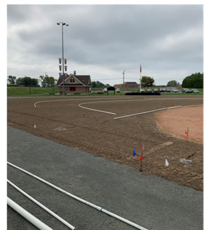
Distributing irrigation piping for installation at the Pepin field