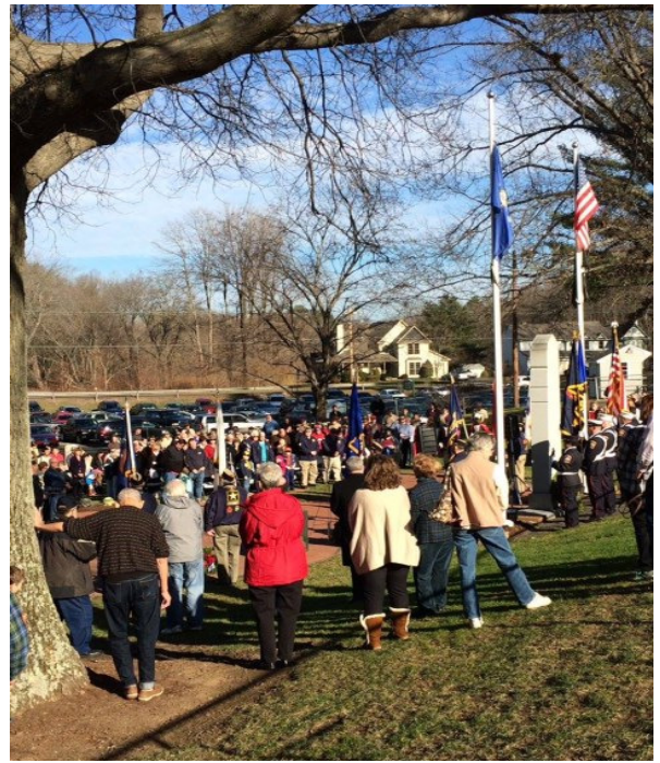
Over 400 attended annual Wreaths Across America ceremony on Sat., Dec. 12 at VMP!