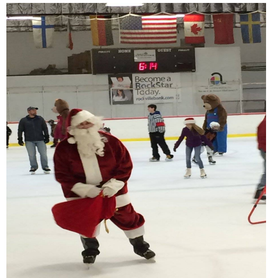
Nearly 300 folks participated in our annual Skate with Santa event on Sat., Dec. 12 th at the S.W. Arena.