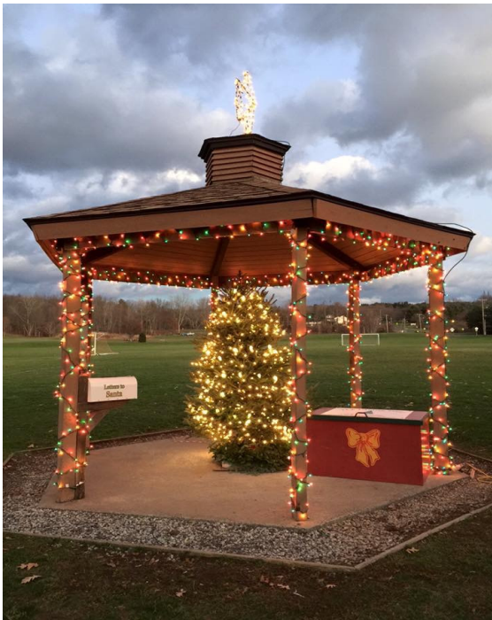
67 Letters to Santa and bags full of non-perishable food items were collected at the Giving Tree gazebo at Nevers Park this holiday season.