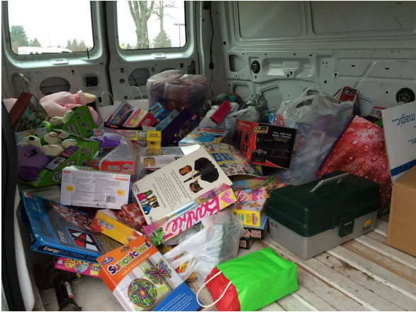
147 toys collected at Skate with Santa donated to "Toys for Tots"!!