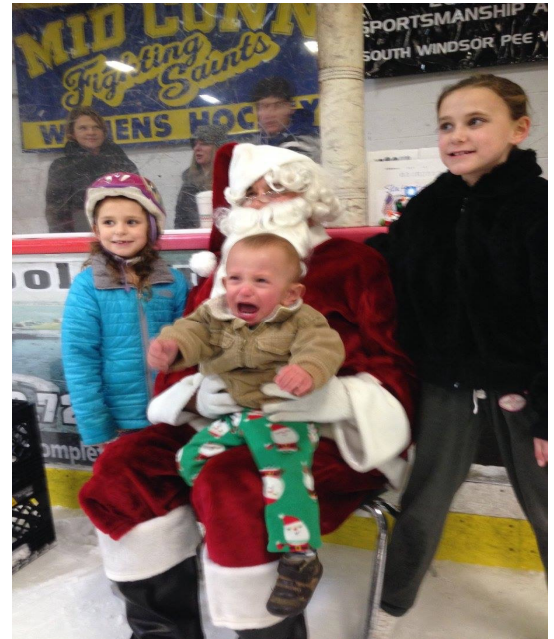
Santa bringing out "holiday emotions" at SW Arena!