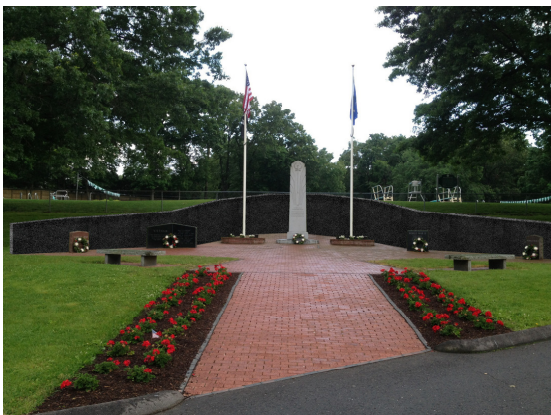
Left: Computer generated rendition of the Memorial Wall coming soon to VMP thanks to S.W. Patriotic Commission!