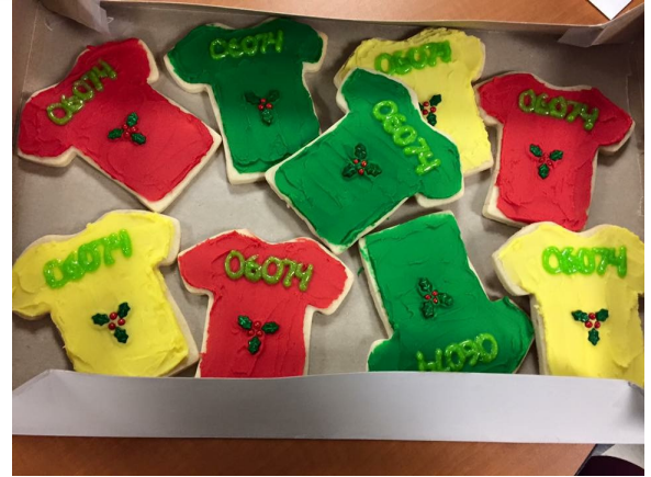
Really cool 06074 T-shirt cookies for the holidays!!!