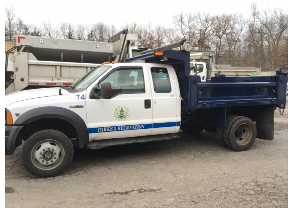
Truck 74 with refurbished bed