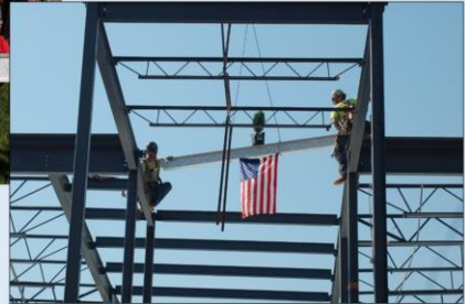
Beam Signing and Topping Off