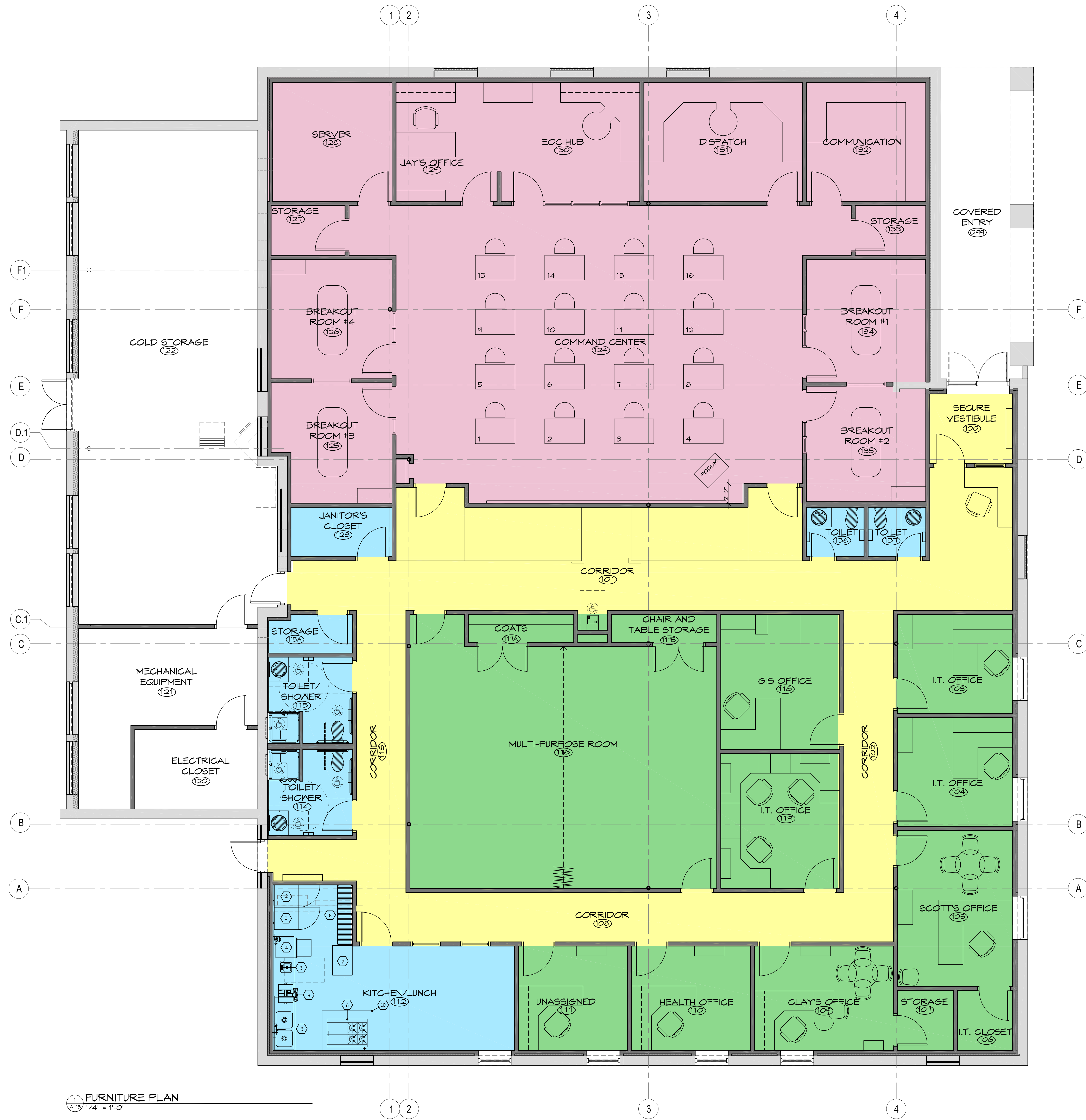
FURNITURE PLAN A-15 1/4" = 1'-0"