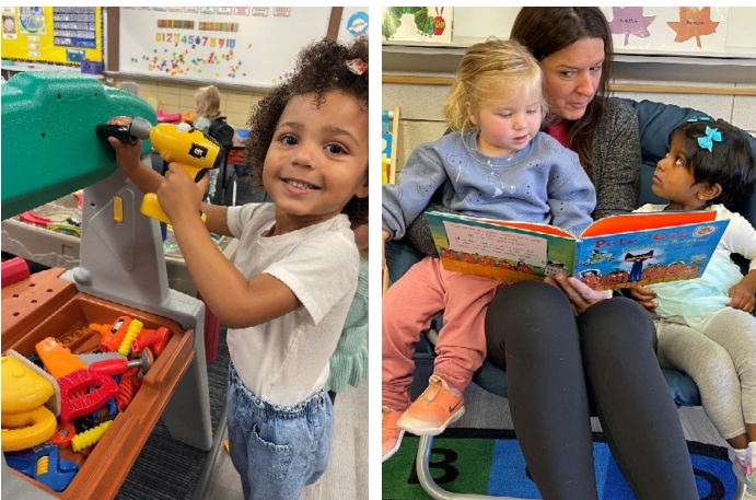
Our preschoolers spent the month learning, exploring and having fun!

4 th "R" had plenty of recreation-based fun again this month! We've been enjoying activities such as scavenger hunts, sensory bins, drawing competitions, and lots of turkey-themed crafts. One site has discovered a new-found love of jump roping, and we've been encouraging each other to practice our skills!