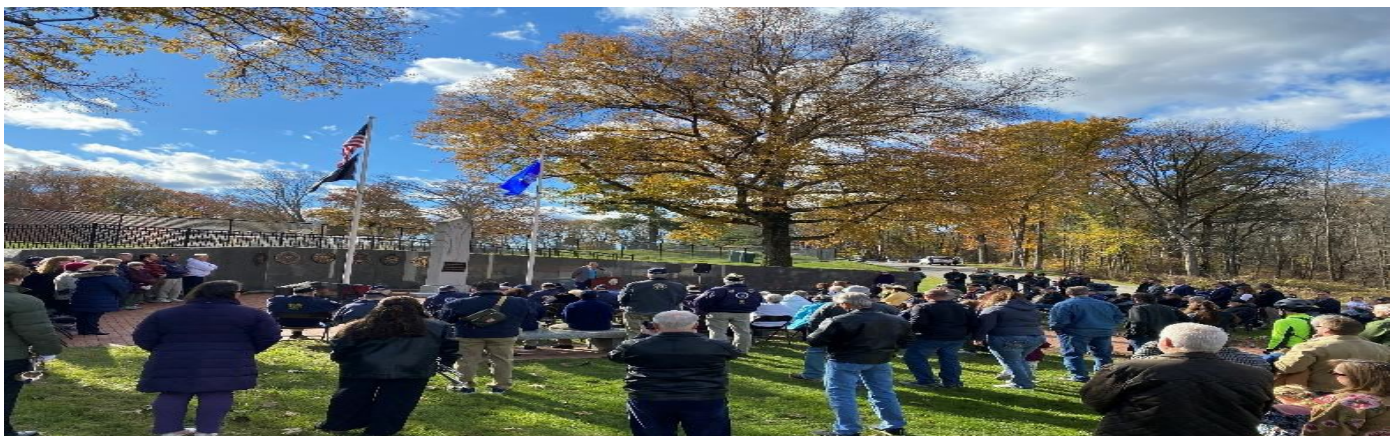
Our Veteran's Day ceremony had over 175 community members attend to honor our Veteran's