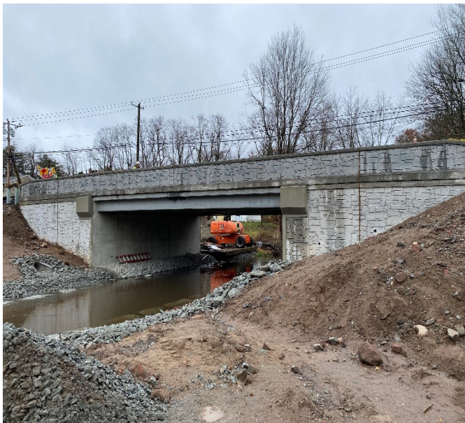
Pleasant Valley Road Bridge

Some utility poles still need to be relocated to complete the new road and bridge work. Other items to be completed include a few sidewalk panels, turf establishment, paving in the lower VMP parking lot, staining the bridge concrete that looks like stone, and clean-up of the staging areas. This bridge and road will be reopened to traffic on December 1, 2023 and remaining items will be completed in the spring of 2024.