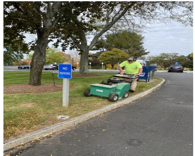
Autumn is the ideal time for overseeding, and we typically utilize around 6000 pounds of seed across parks, facilities, and athletic fields.