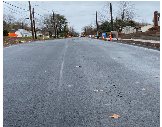
Pleasant Valley Rd looking east from the bridge

Burns Construction completed milling and paving about 3.4 miles of Town roads including Fairview Drive (from Clearview Drive to cul-de-sac), Homestead Drive, Clearview Drive, Juniper Lane, Kent Lane (from house #169 to cul-de-sac), Mara Trail, Sawmill Lane, and Tumblebrook Drive (from Clearview Drive to Homestead). They also milled and overlayed Miller Road (From Ellington Road to Abbe Road), Old Farm Road and Benjamin Way. Additional Town roads are scheduled to be milled and repaved in 2024.