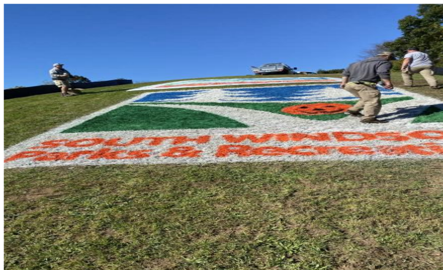
Prepping for the very successful Park & Recreation Pumpkin Roll!