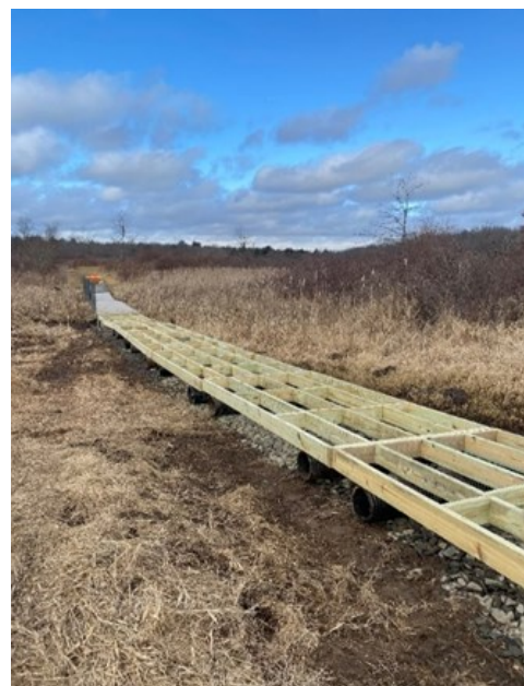
The Parks Crew made improvements to replace old bridges and walkways at the Donnelly property.