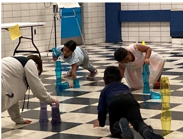
Minute to win it challenges at our Family