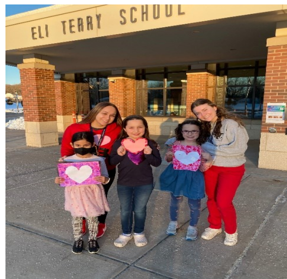
Winter Scavenger hunt fun at our preschool! Valentine exchanges at 4 th R.