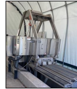
Existing UV Bank that has been in service for 20 years.