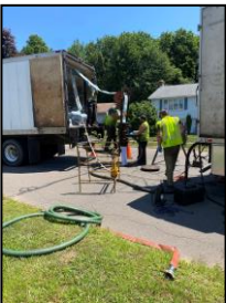
Image shows crews inserting the new sewer lining on LeFoll Blvd.